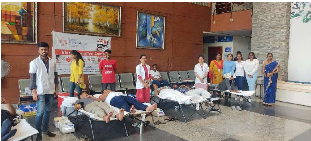
Pic 3: Donors Donating Blood