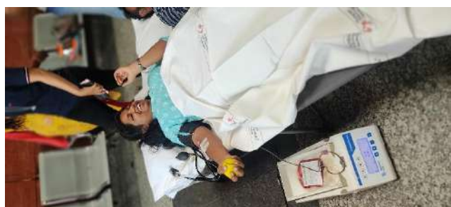
Pic 4: Girl Students volunteering for donating blood