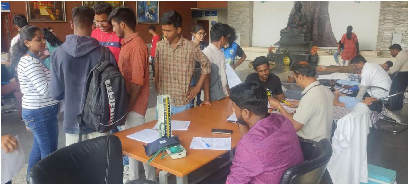
Pic 1: Registration of Donors