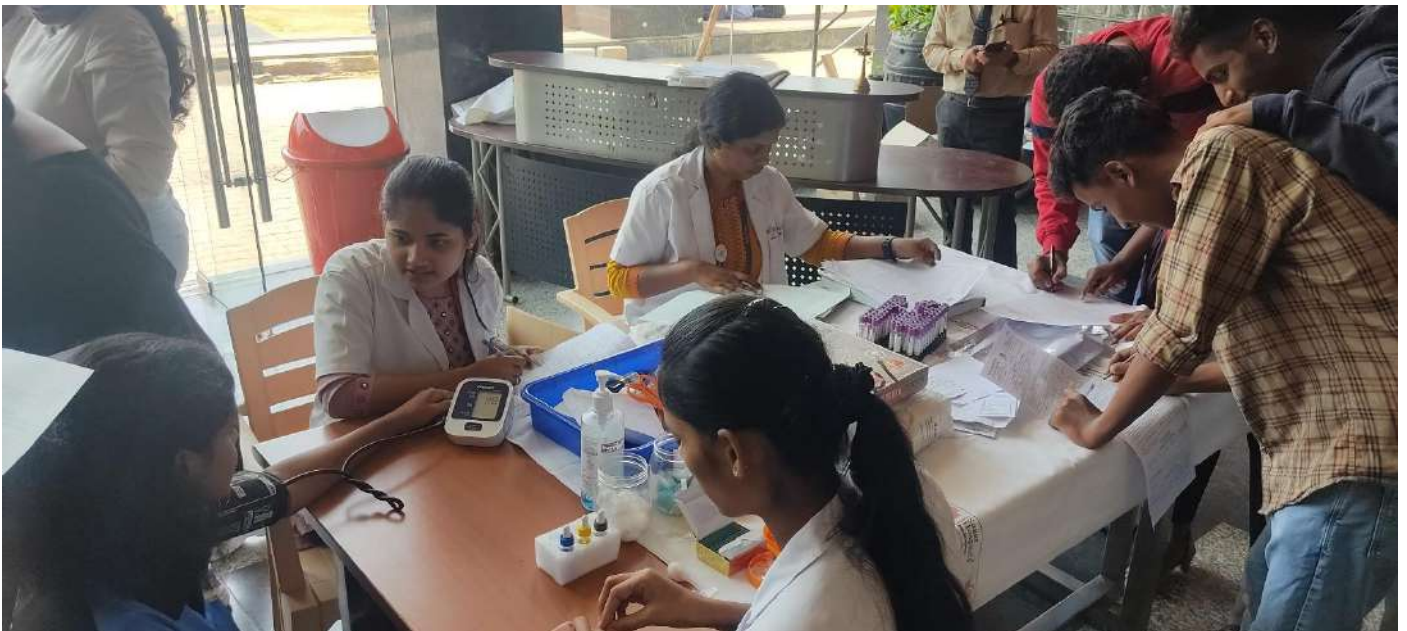
Pic 2: Testing Blood Group and General Check up