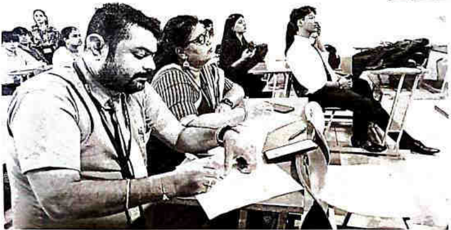
Pic 3: Judges Panel for the event