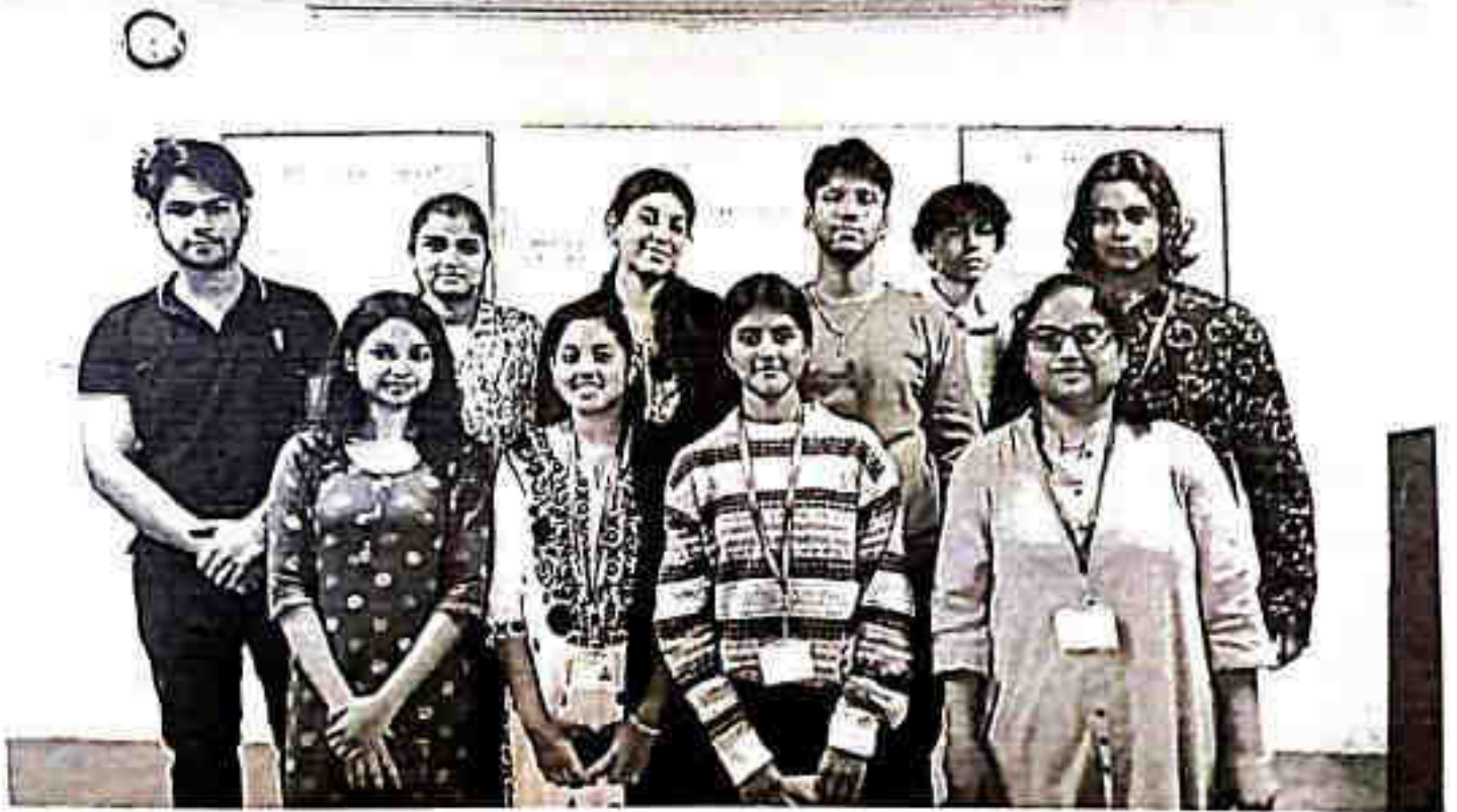
Pic 5 :s shortlisted students for group discussion and personal interview