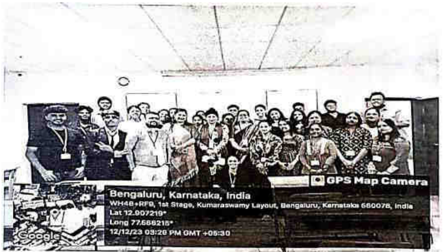
Pic 2: Event Student Coordinators, Participants with Faculty Observers and Judges