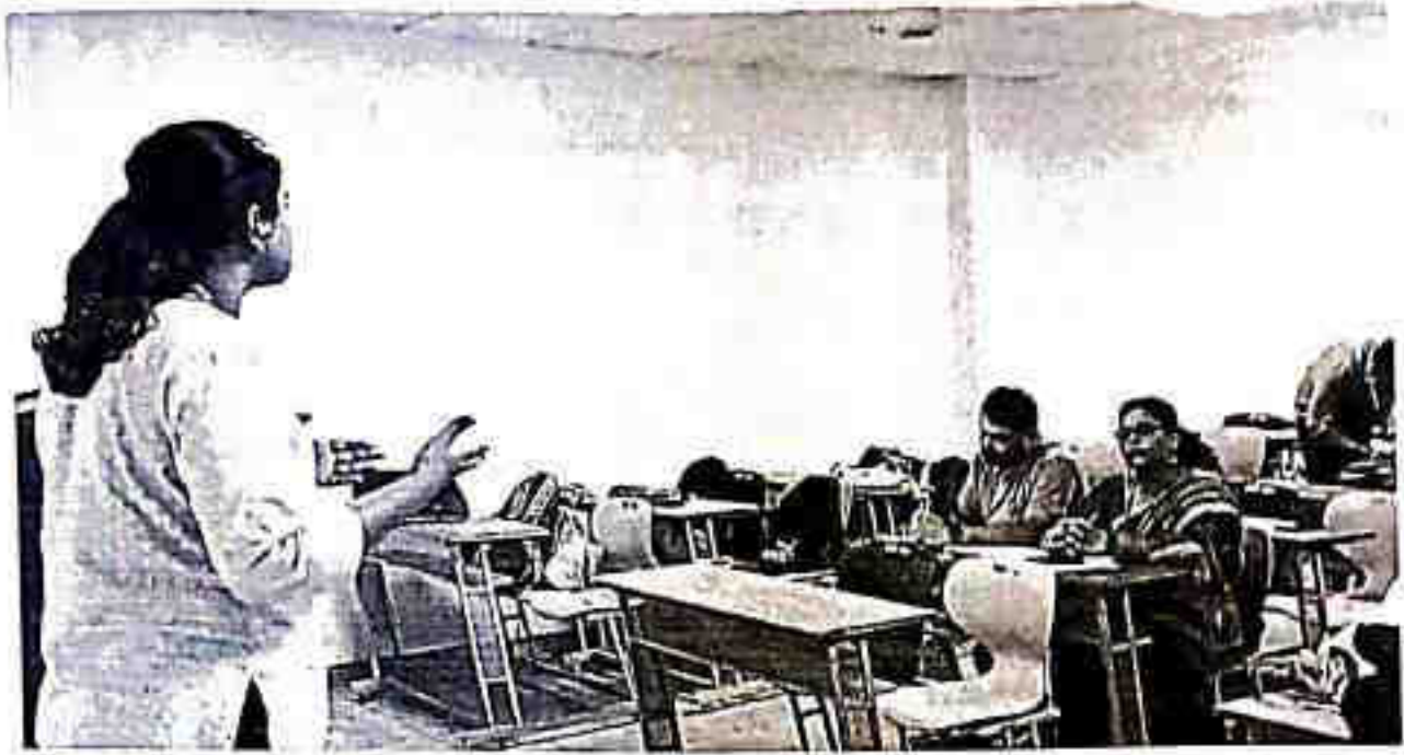
Pic 4: Participates explaining there pick and speak topic