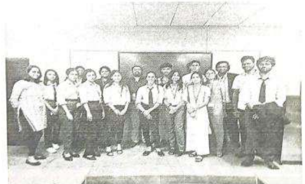
Pic 4: Event Student Coordinators, Participants with Faculty Observers