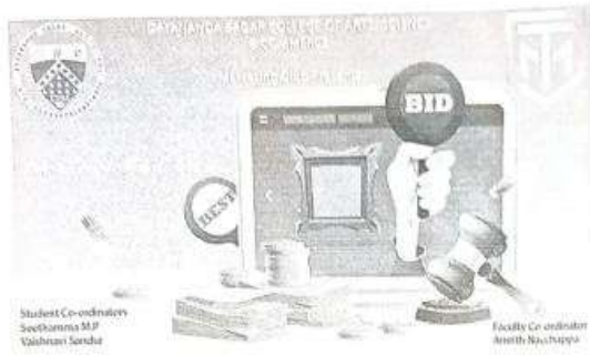
Pic 1: Poster of the Event