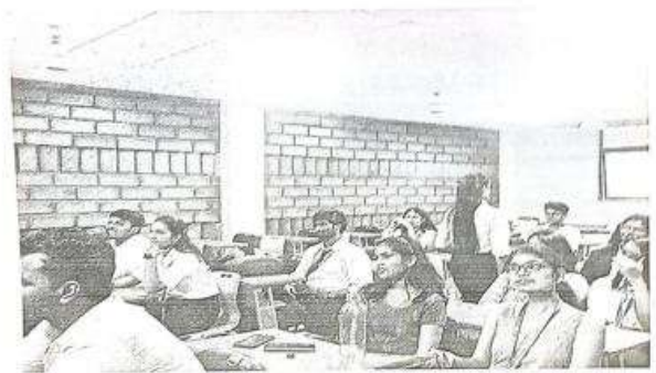
Pic 3: Participants for the day