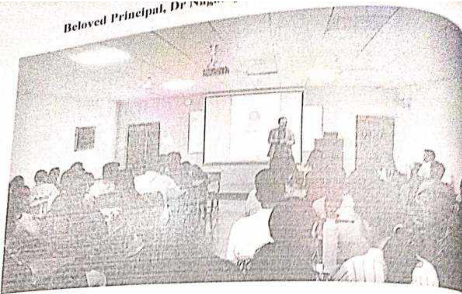
Students interacting with Club coordinators