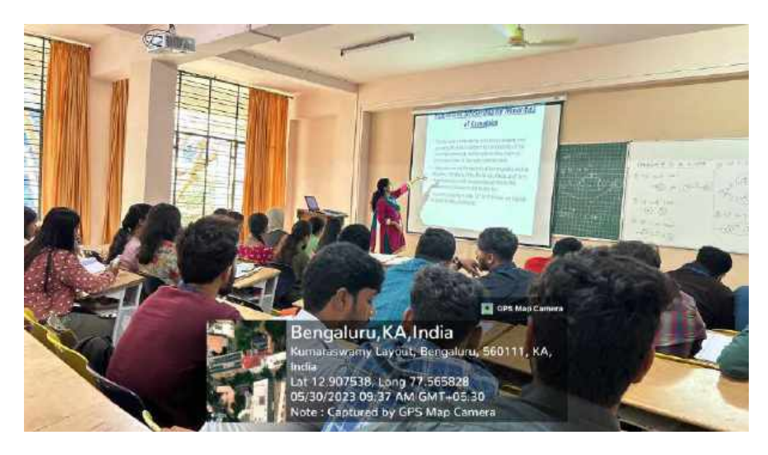
Photo3: Post metric scholarship for Minorities