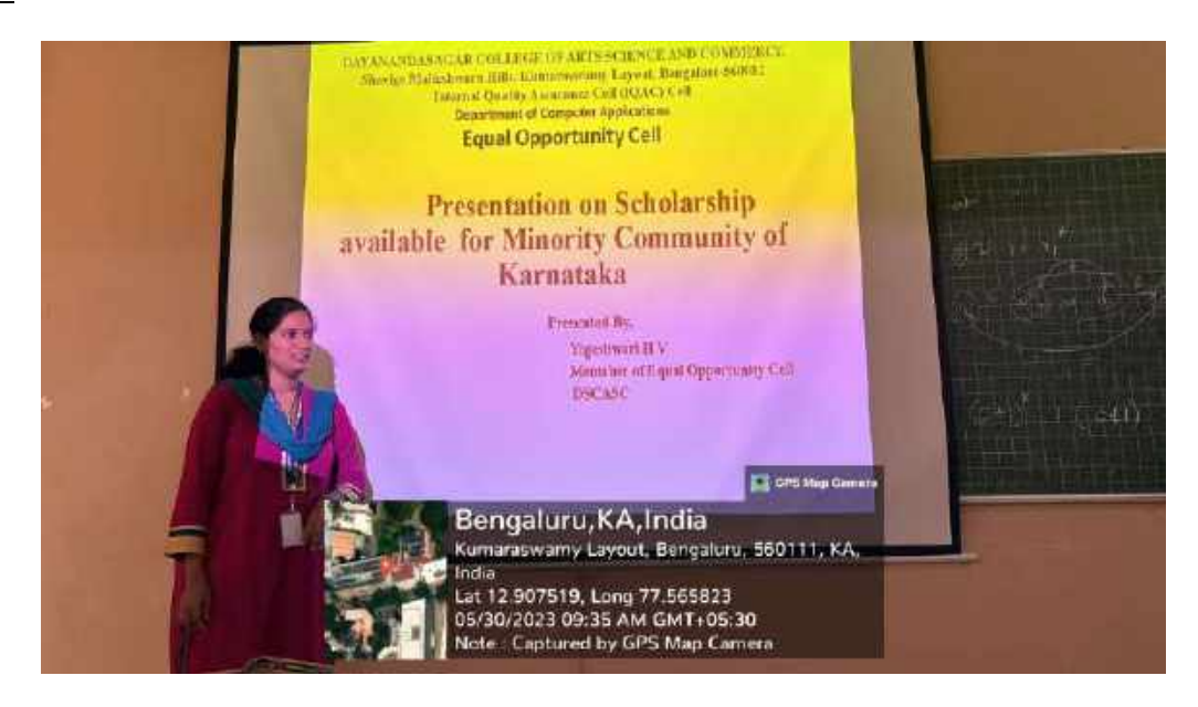
Photo1: Presentation on scholarship for minorities