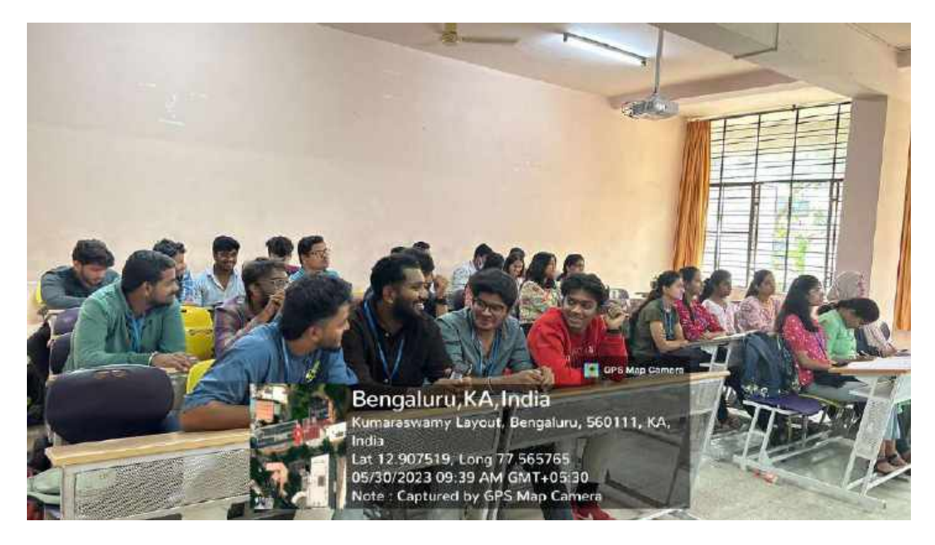
Photo4: Students participated in the presentation