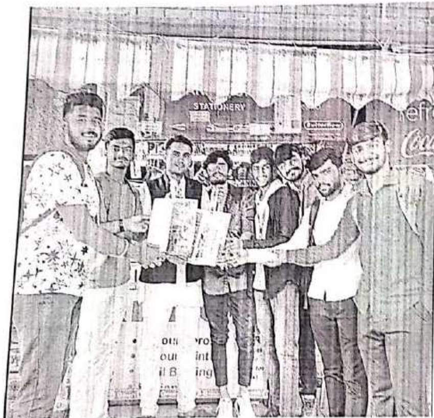
Paper bag distribution