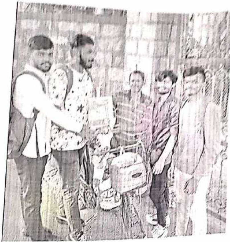
Awareness on Plastic free environment