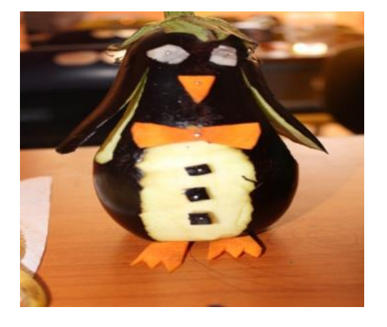
Vegetable carving completion