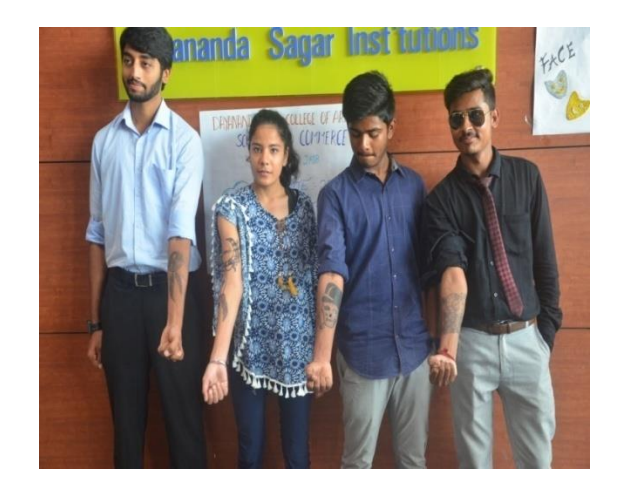
Tattoo making competition