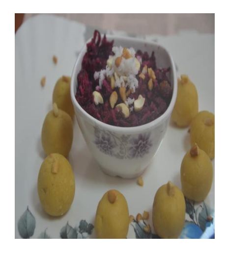
Cooking without fire competition