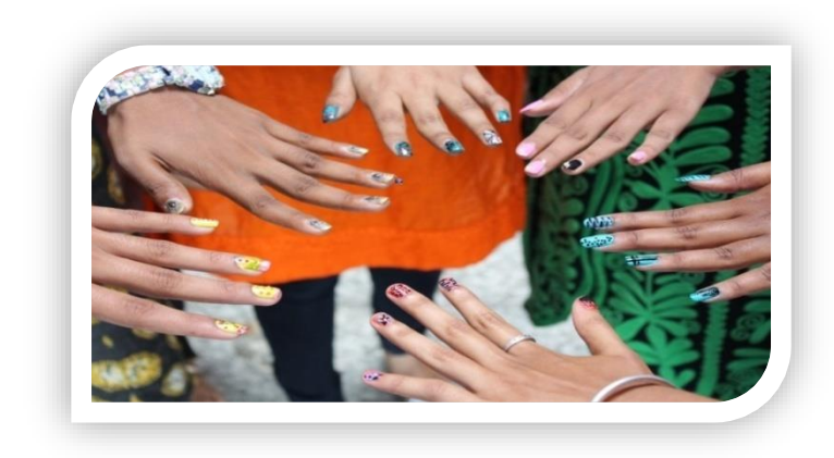
Nail art competition