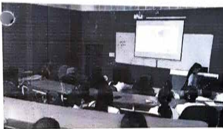
List of Activities conducted