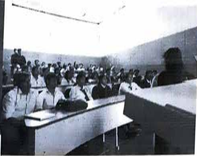
Orienting Students about importance of services