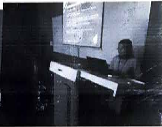
Orientation on services