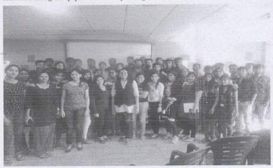
Students at the end of the pre-placement training program