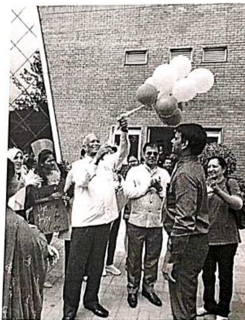
Secretary, DSI releasing the Balloons