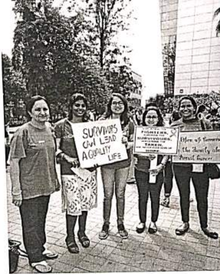
Participants with Placards