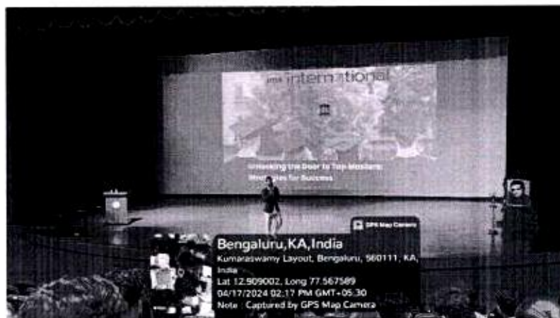
Pic 7 – IMS International Skill enhancement