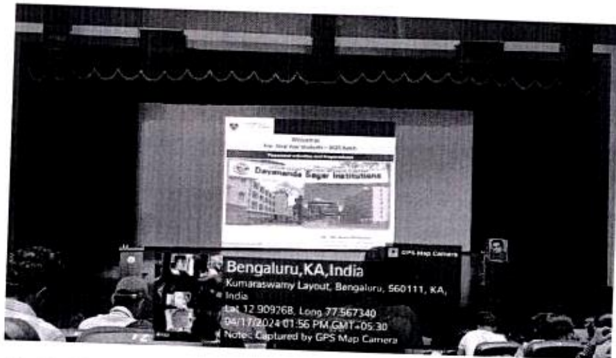
Pic 1 – Introduction and welcome to the session