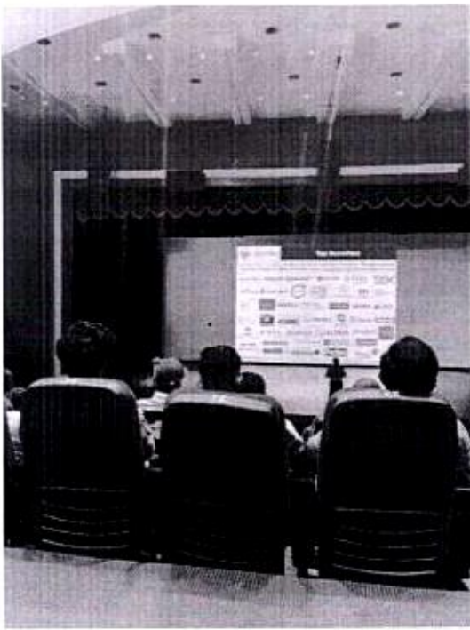
Pic5-Top recruiters at DSI