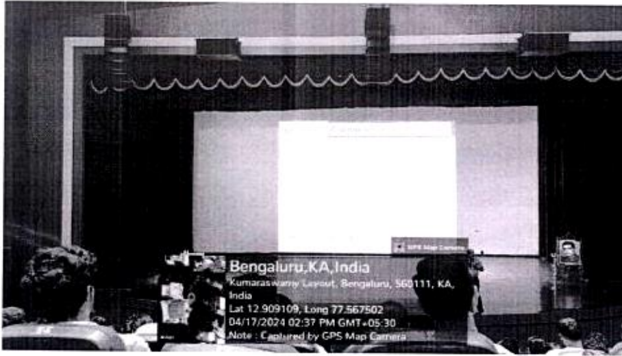
Pic 3-Common Selection process