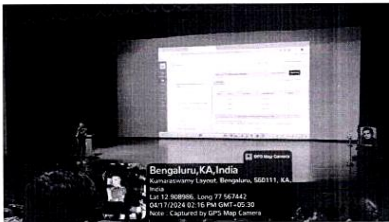
Pic 6 – Demo session for Neopat platform