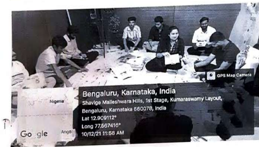
Photo 3 & 4 : Students distributing the eco friendly paper bags to small street vendors and medicals in Kumarswamy layout.