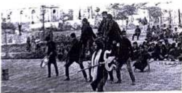
Street play by students of MBA on Aids awareness