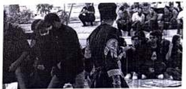
Street play by students of MBA on Aids awareness