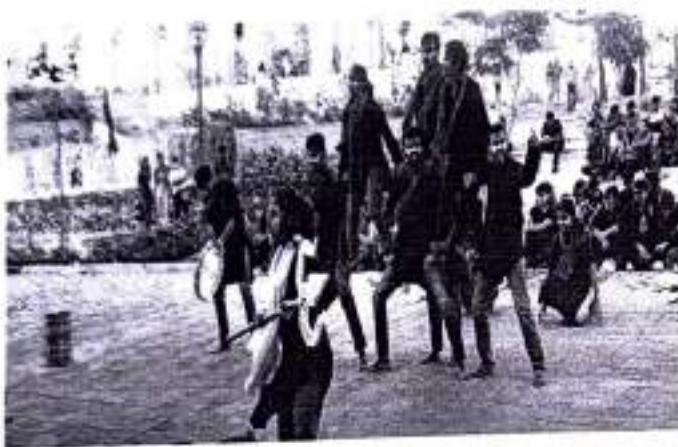
Street play by students of MBA on Aids awareness