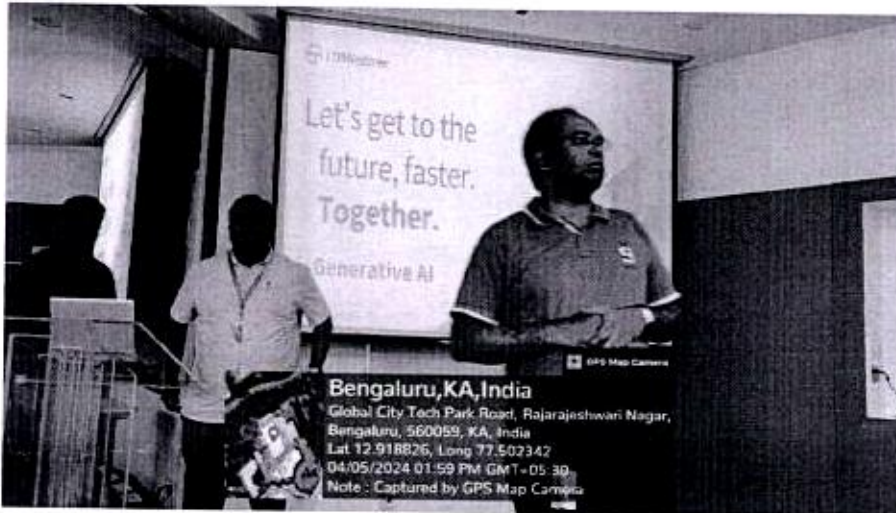
Pic1 _Introduction to the session