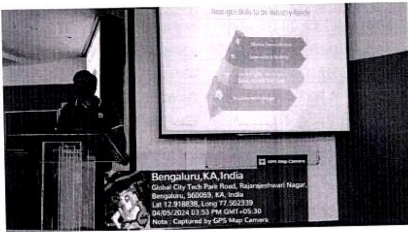
Pic6_Skills required to industry ready