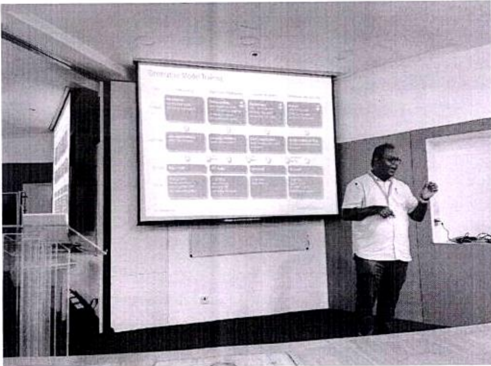
Pic3_Generative Model Training