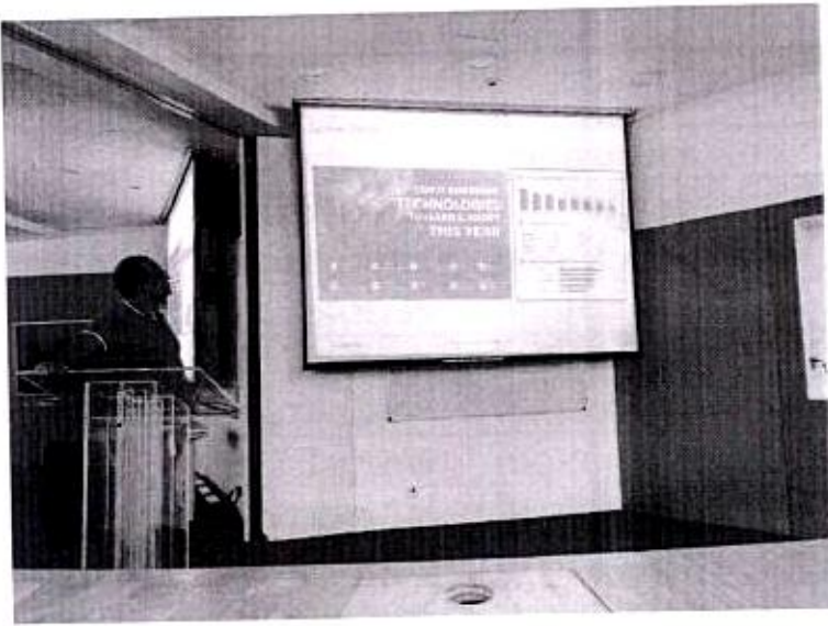
Pic5_Top emerging technologies to learn