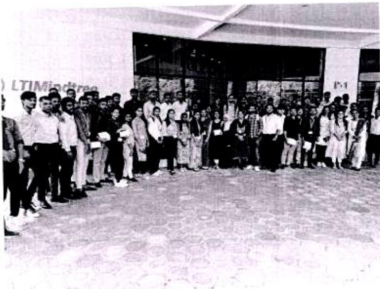
Pic 7 _ Group photo with the speakers