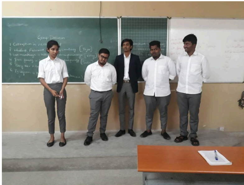
Photo 6 : 2 nd Sem Students discussing the topic about social media.