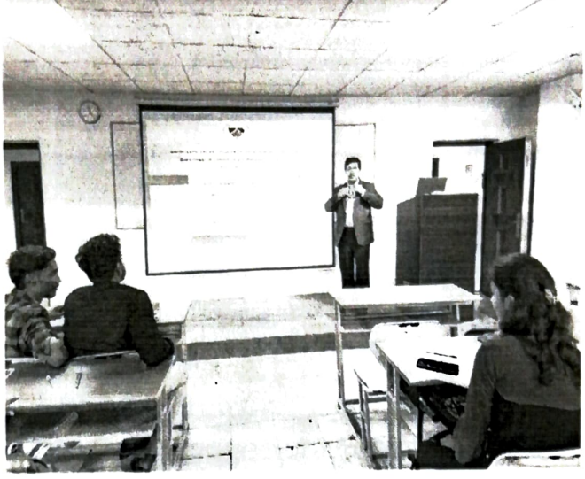
[Pic-1: Resource Person giving introduction about Employability skills]