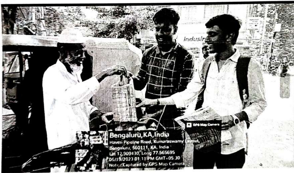
Awareness on Plastic free environment