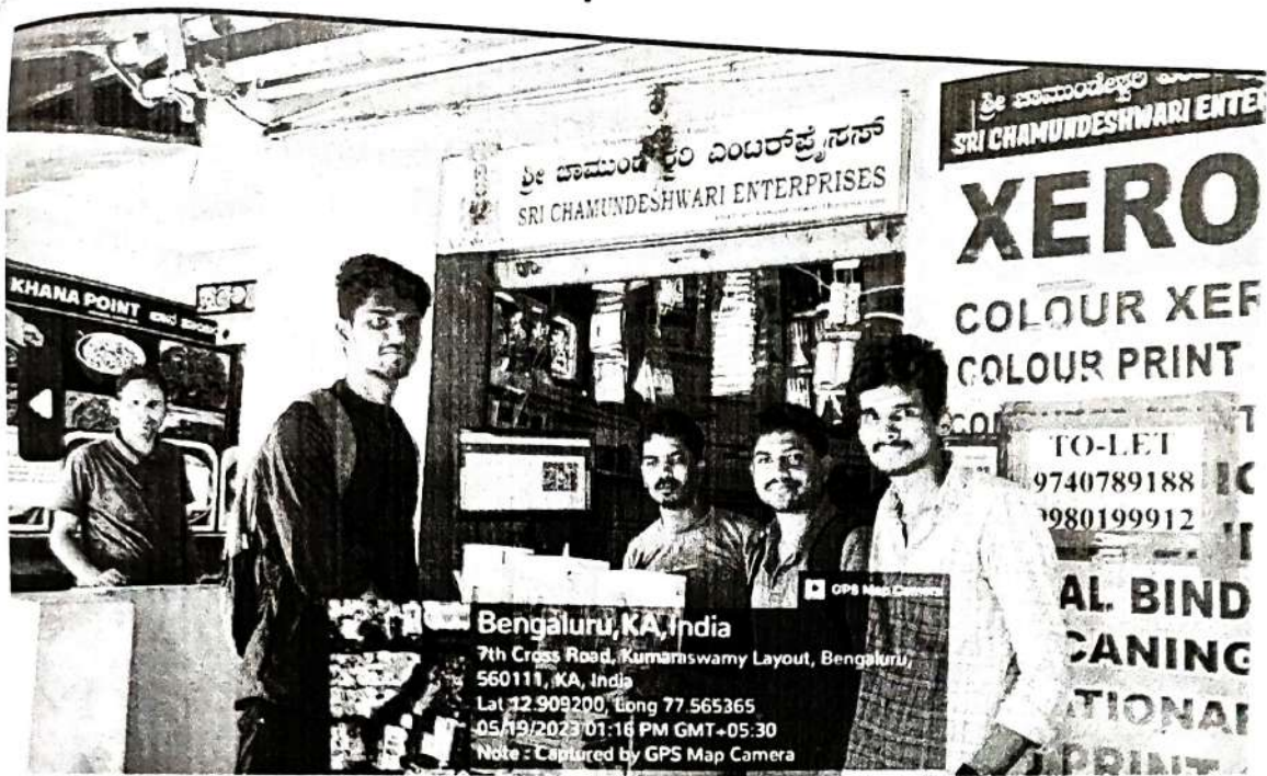
Paper bag distribution