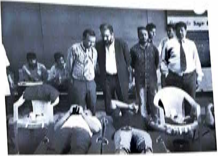
Pic No. 2: Students Donating Blood