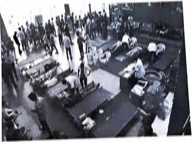
Pic no. 3: Donors registration and donation of blood