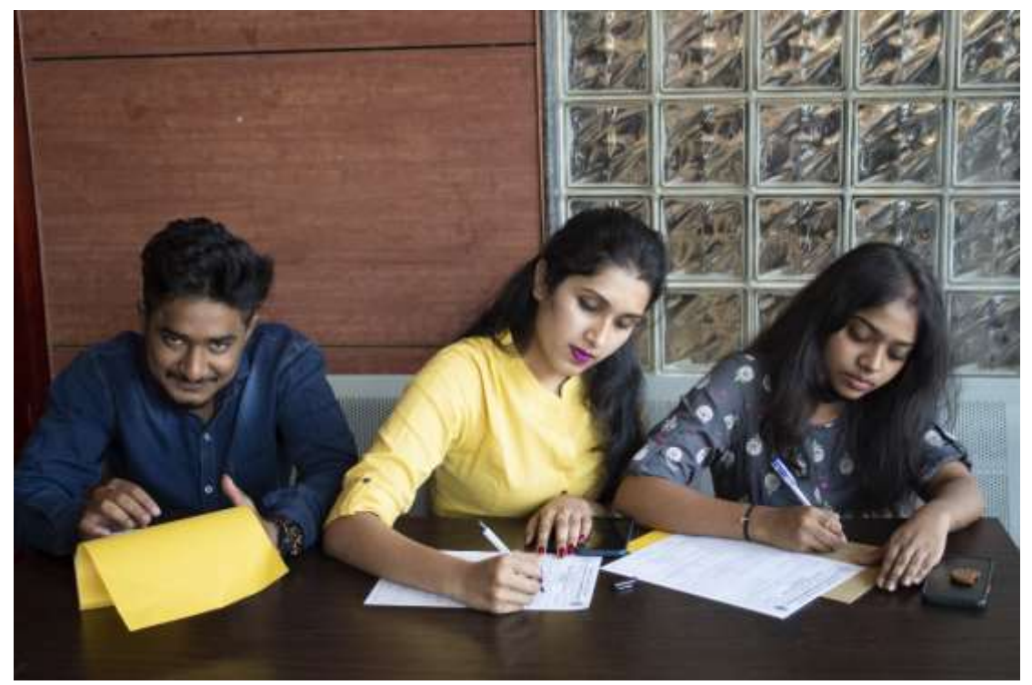
Pic No. 1: Registration