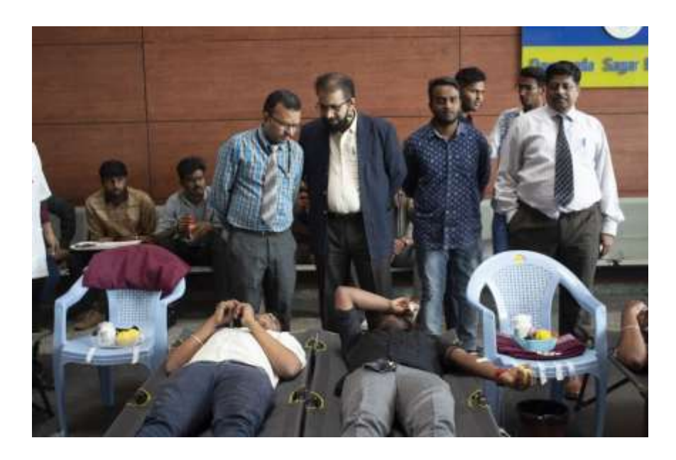
Pic No. 2: Students Donating Blood