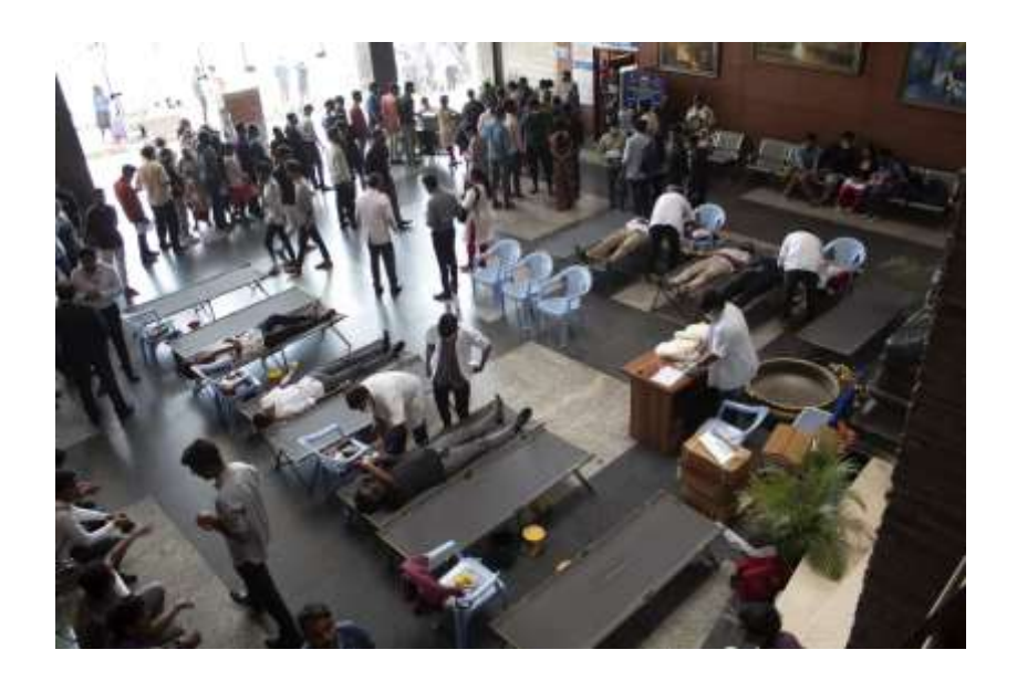
Pic no. 3: Donors registration and donation of blood