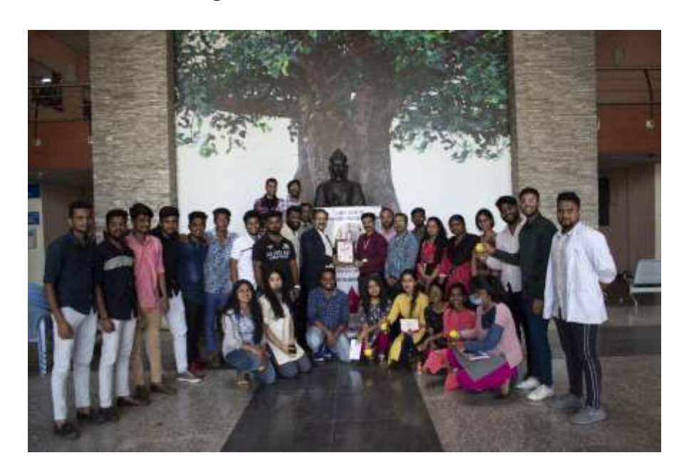
Pic no. 4: Photo with Volunteers of Blood Donation, Doctors, Medical Officer, Coordinators, HOD, Vice-Principal, and Principal.