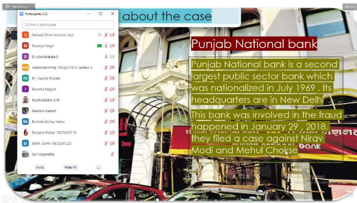
Photo: 3 Case study presentation