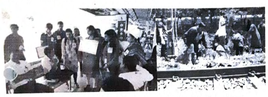
Narrating importance of cleanliness