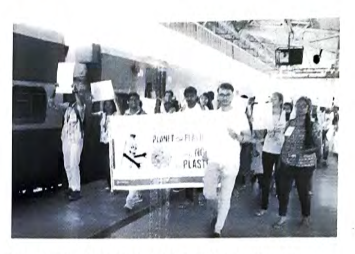
Awareness March against single use plastic