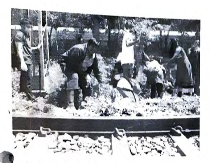
Collecting plastics littered along the tracks