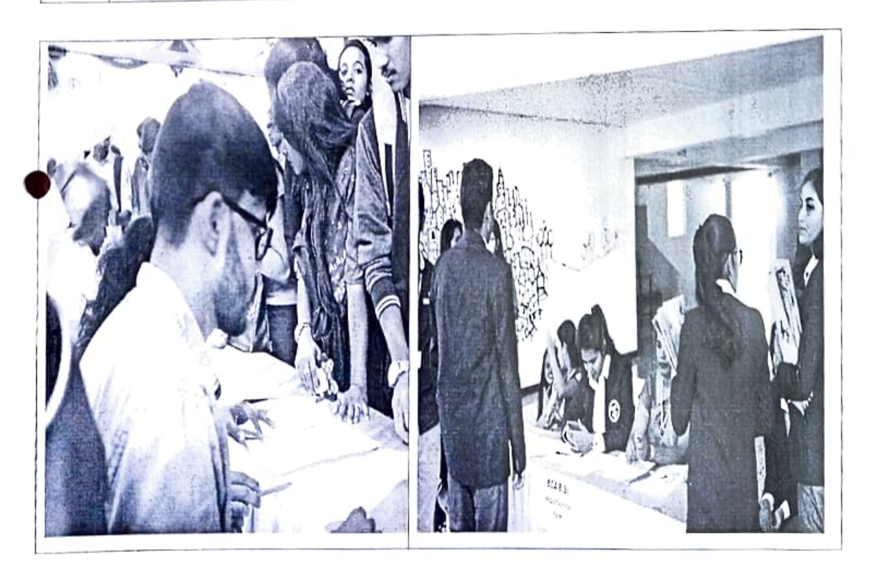
Photo2: Students enrolling themselves with the respective course counters