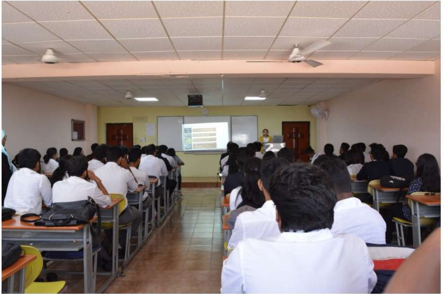
Photo2 :Students Actively Participating in the Orientation programme