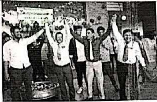
Photo 1- Winners of Balloon bursting competition

Photographs of the Event (At least 10 relevant, clear, and appropriate photos with title and explanation. The jpg files need to be attached)