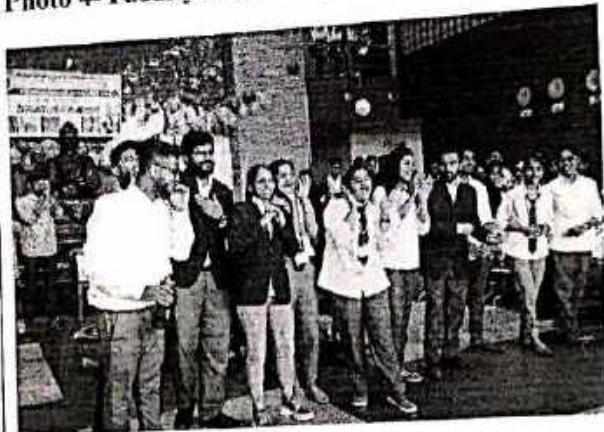
Photo 5- Theater club members performing skit