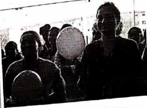
Photo 4- Faculty members playing the game