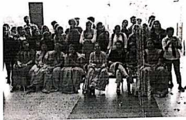
Photo 2 - Teachers participating in Anthyakshari