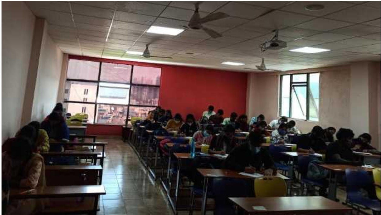
Essay writing competition on 21-01-2021 around 30 students were present