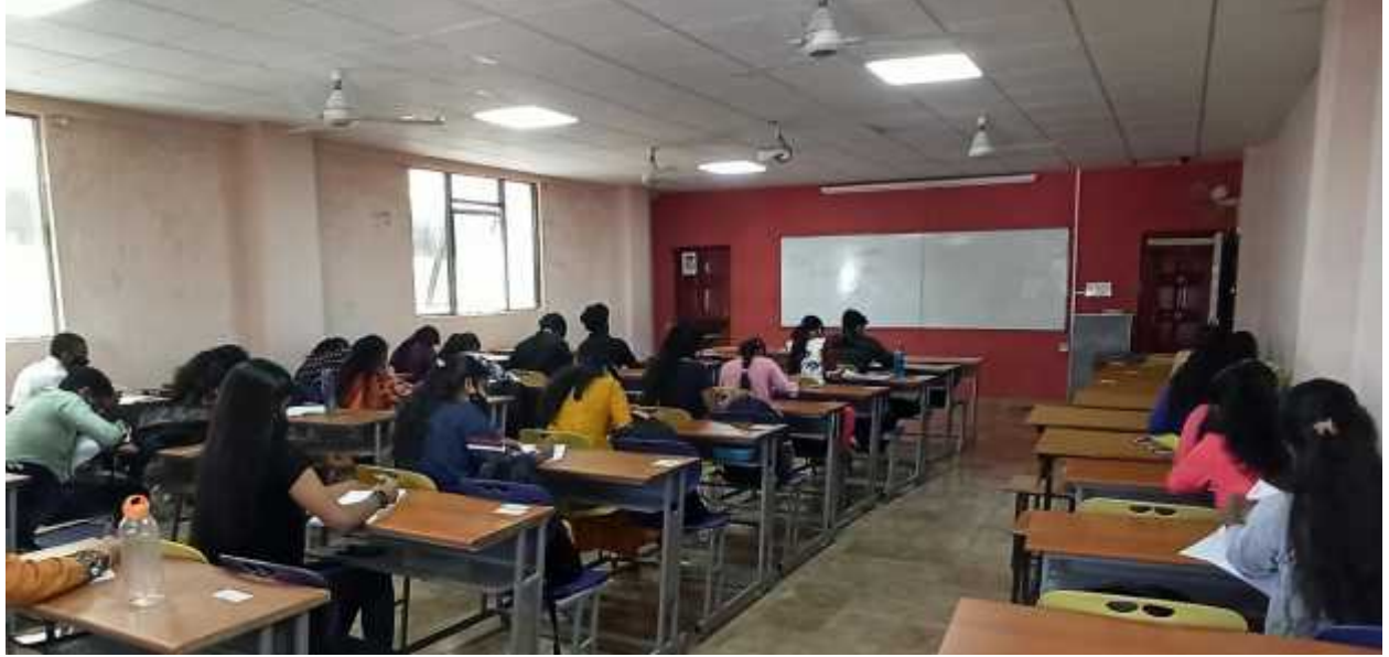
Essay writing competition on 21-01-2021 around 30 students were present