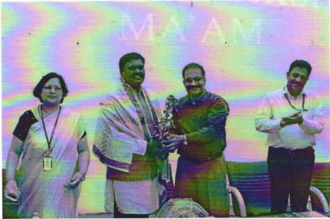
Awarded Best Outgoing Boy & Girl from M.Com