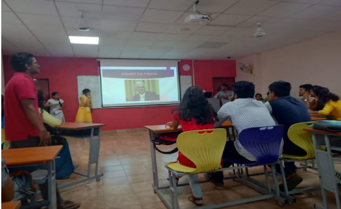
The Literary club of M.Com Dept. had conducted Skillorama (a memory based activity) on 4 th of Nov. 2019.