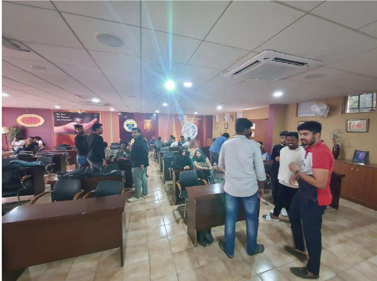
Pic 1 : Team work and interpersonal skills activities