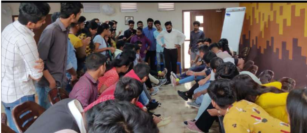
Photo 3: Activity done by the students under speakers' supervision