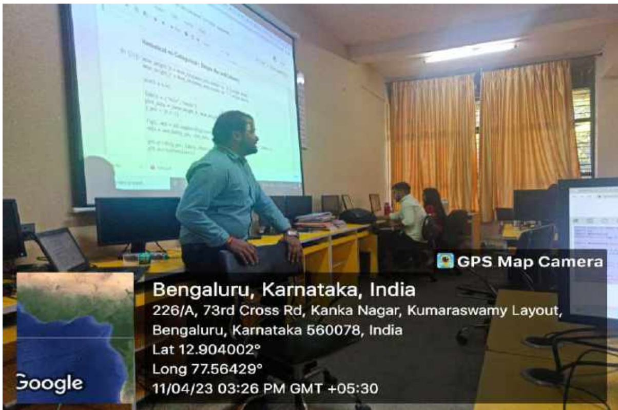
3. Explaining Tuple Example