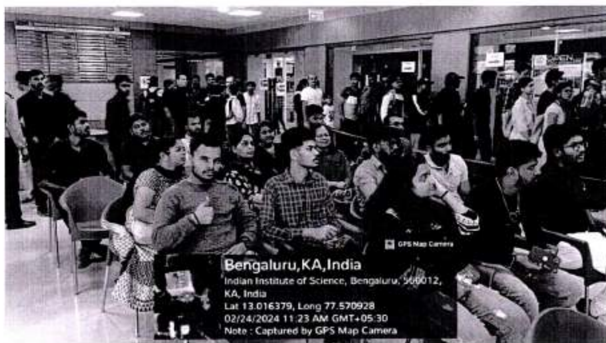
Pic8_Students listening to the session