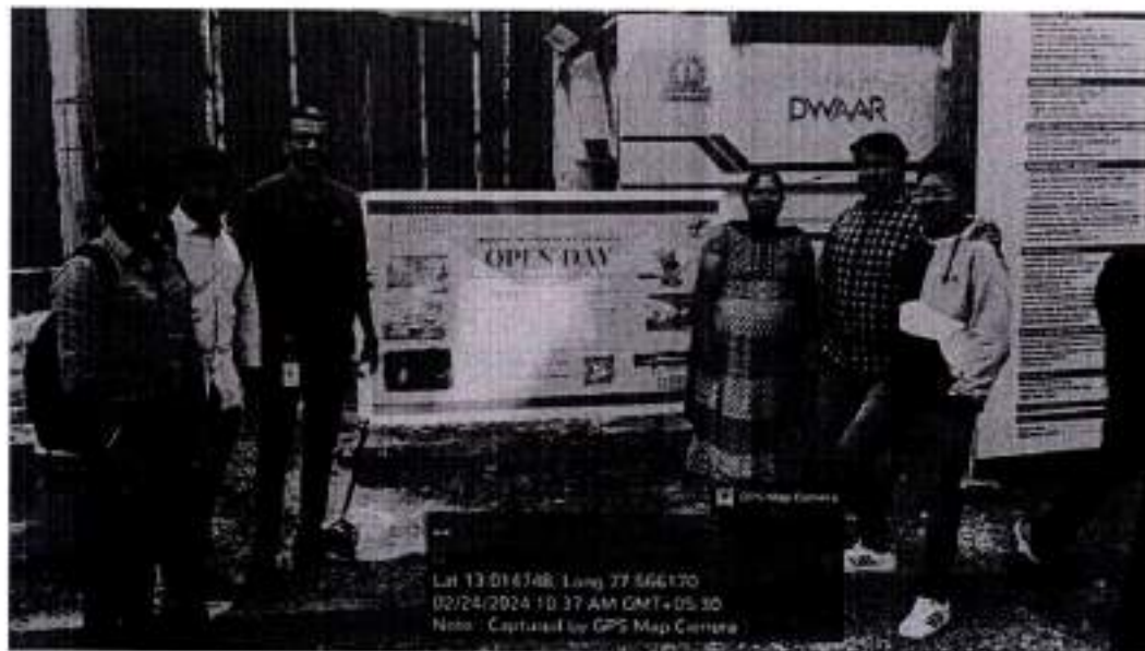
Pic 1_IISC Open Day pic with students and faculty_1