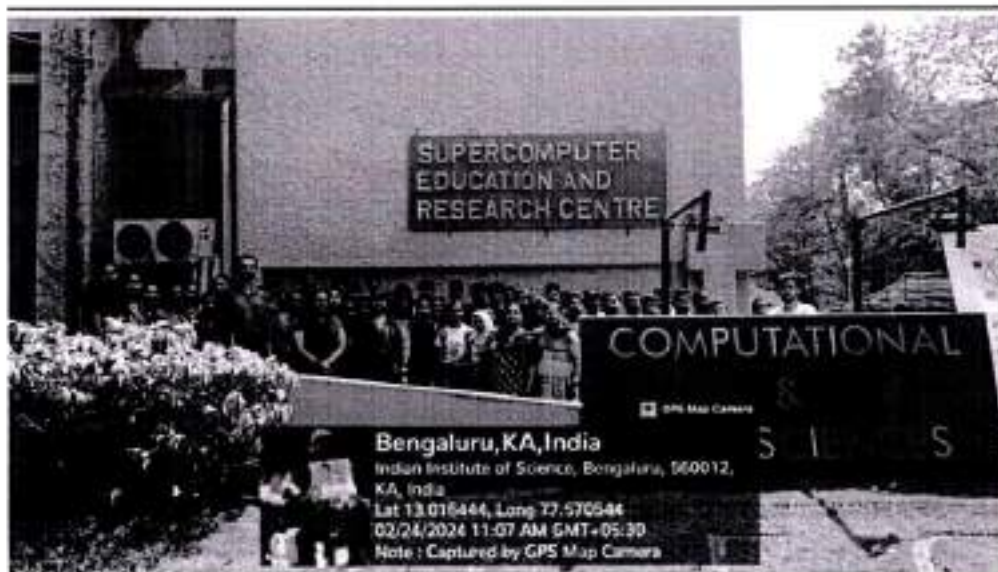
Pic4_SERC and CSD department