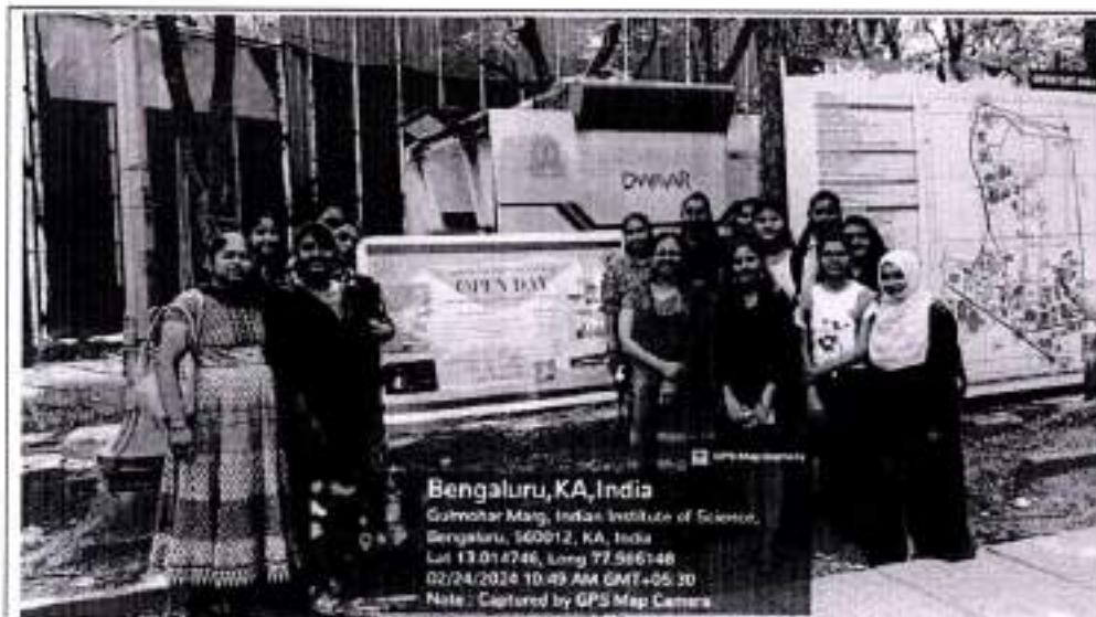
Pic 2 _ IISC Pic with students and faculty_2