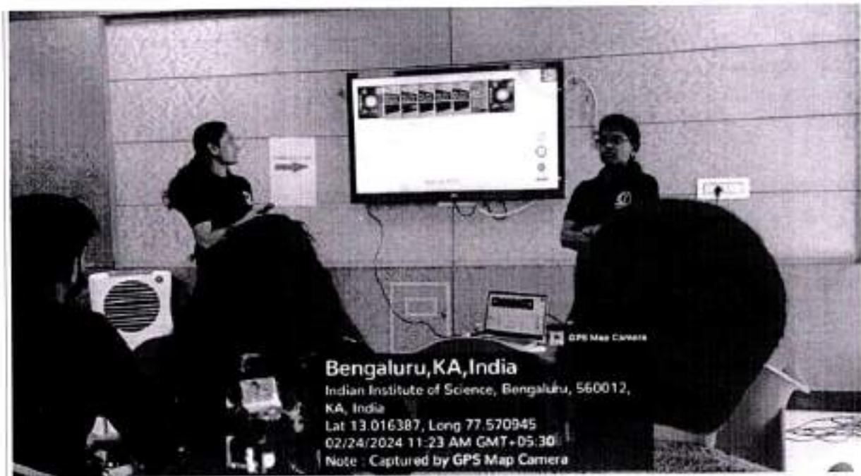
Pic 6: Explanantion session about Pravega