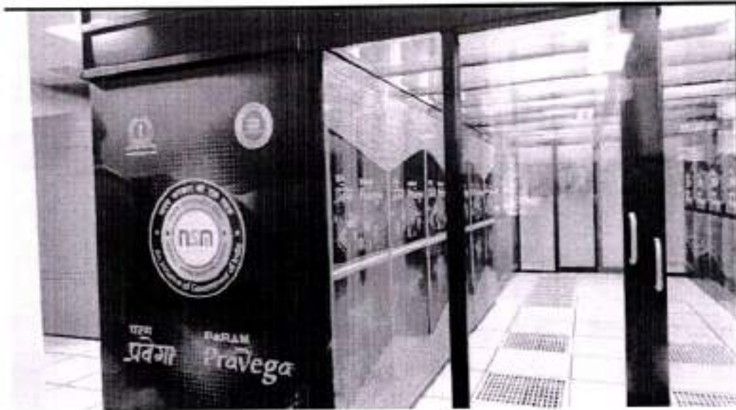
Pic5_Pravega super computer