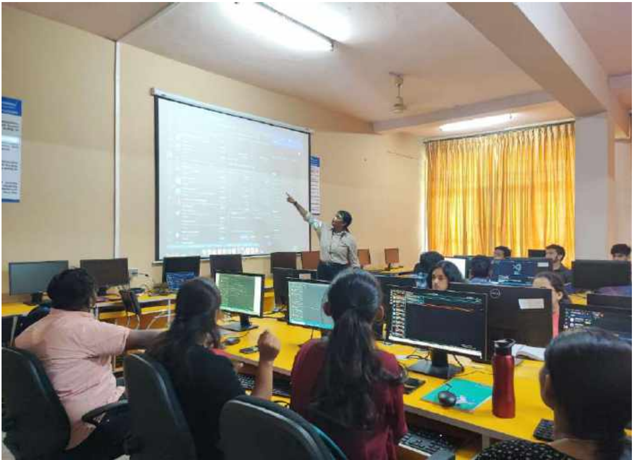
2. Branching Example