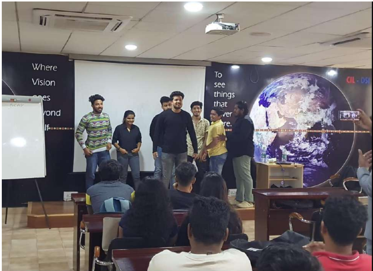
Pic 1 : Students doing the activity