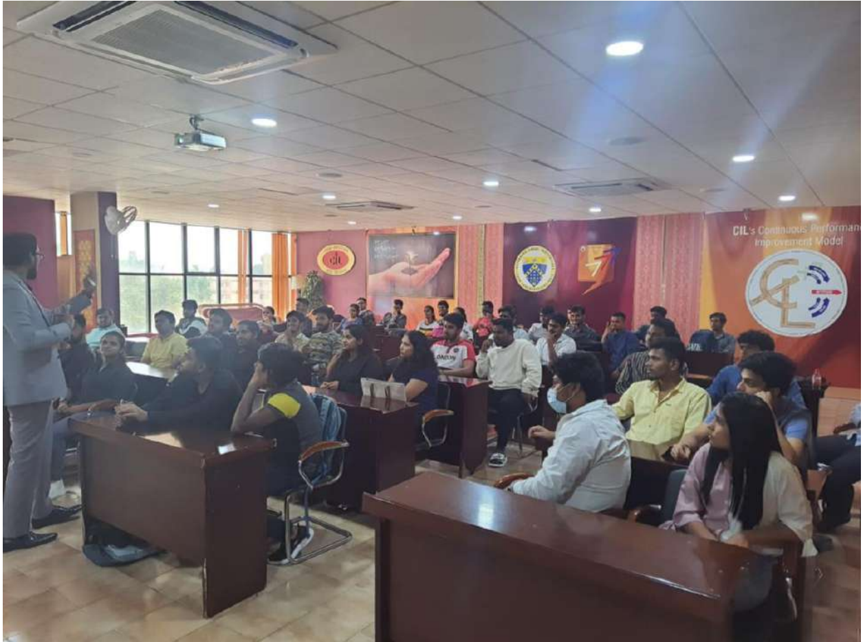
Pic2 : Trainer explaining corporate culture