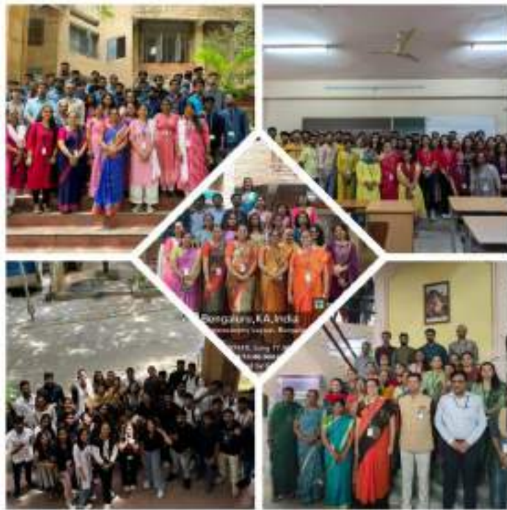
Photo 4 : Spectrum Week with all colours