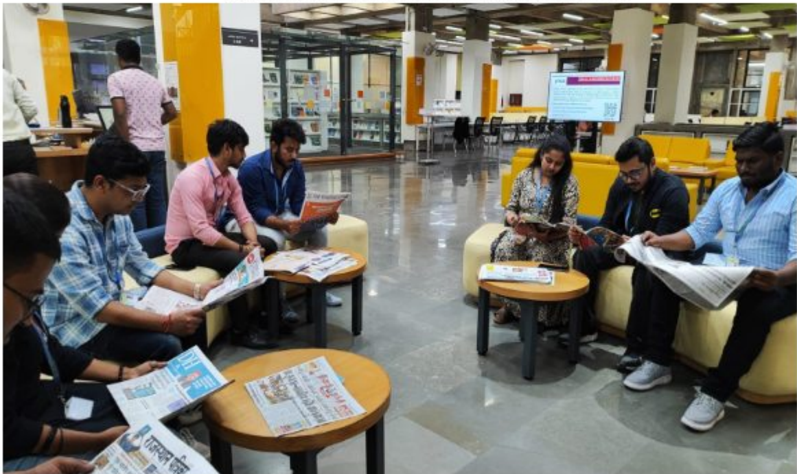
4. Students at IIMB Library