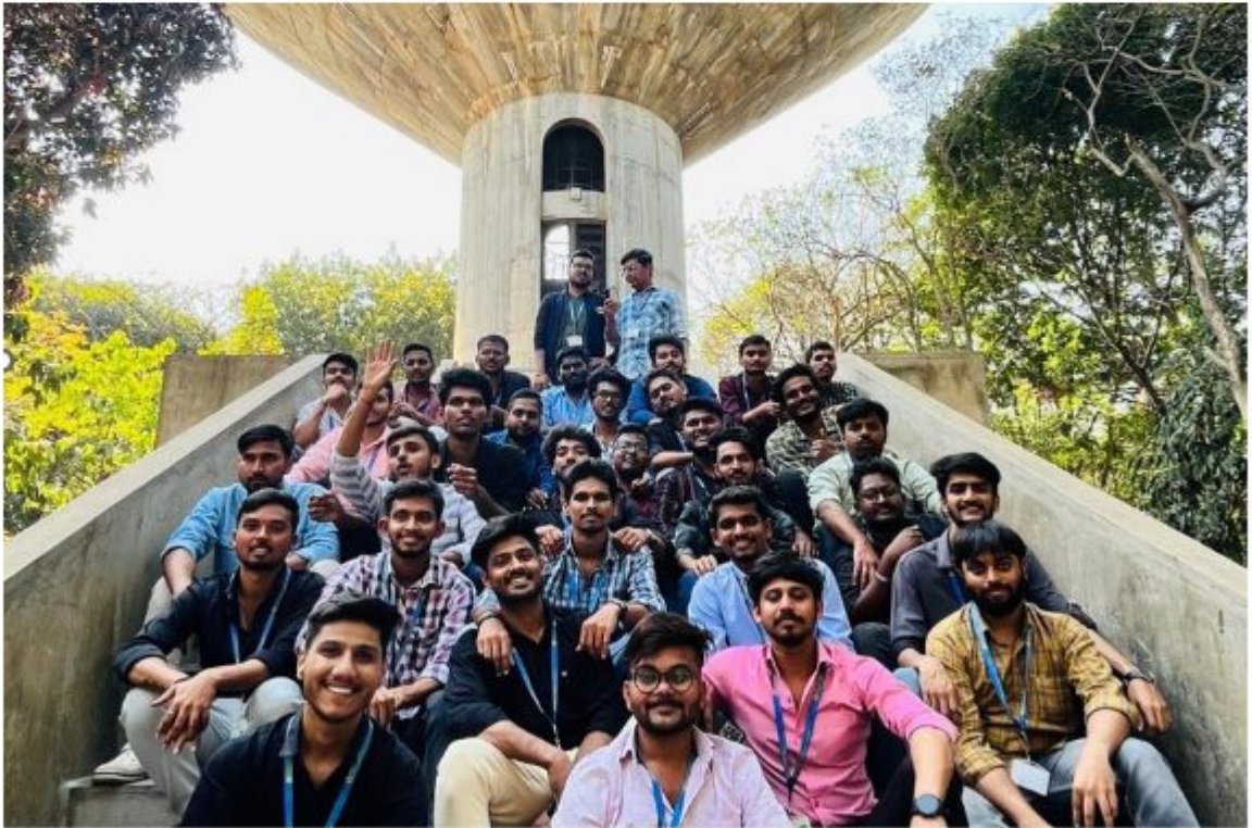
6. Group Photo