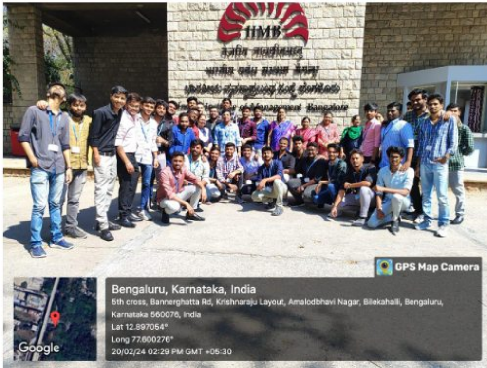
1. Students at IIMB