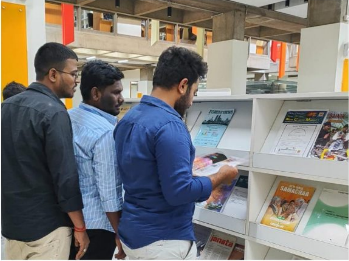
5. Students at Library