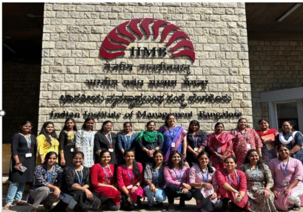
2. Students at IIMB