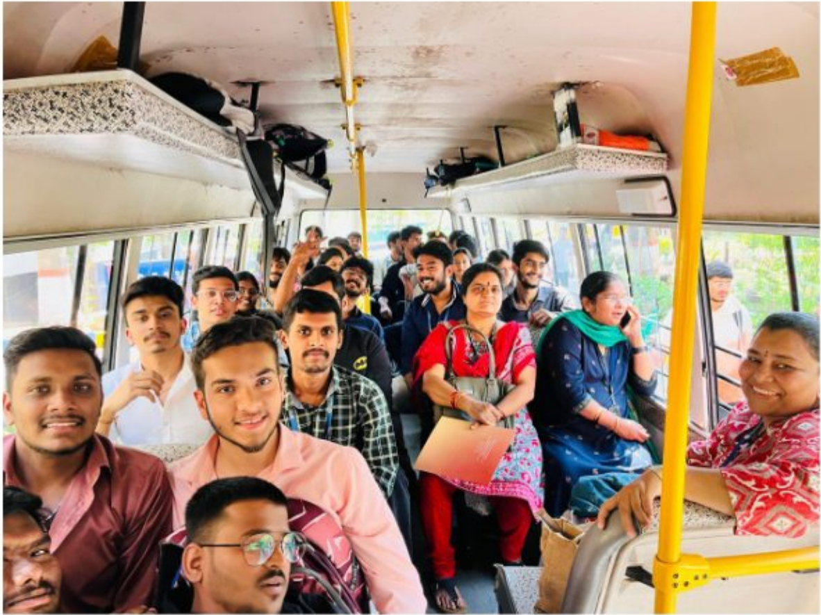
3. Students travelling to IIMB by College Bus