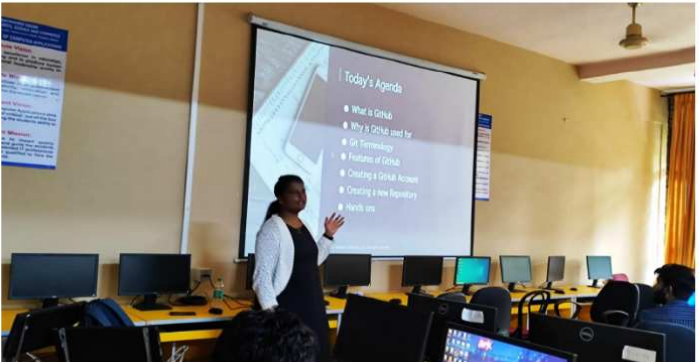
2. Agenda of the workshop