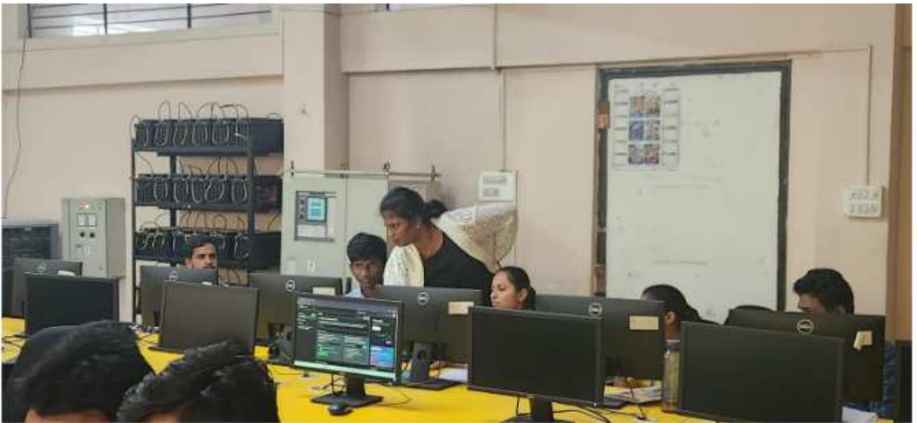
5. Doubt Clearing