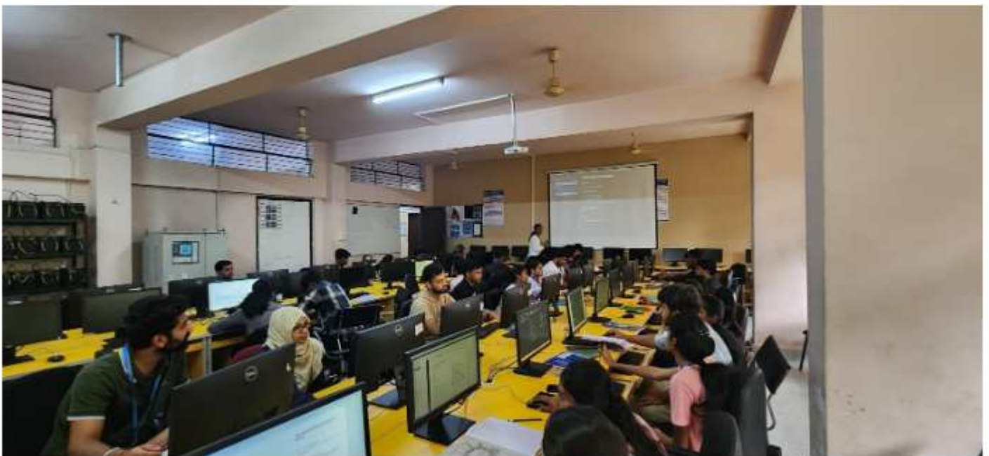
4. Students Participation