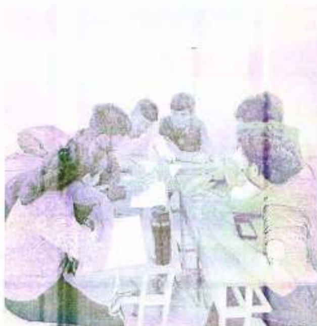
Intense discussions underway within a team on the flow of their App's functions