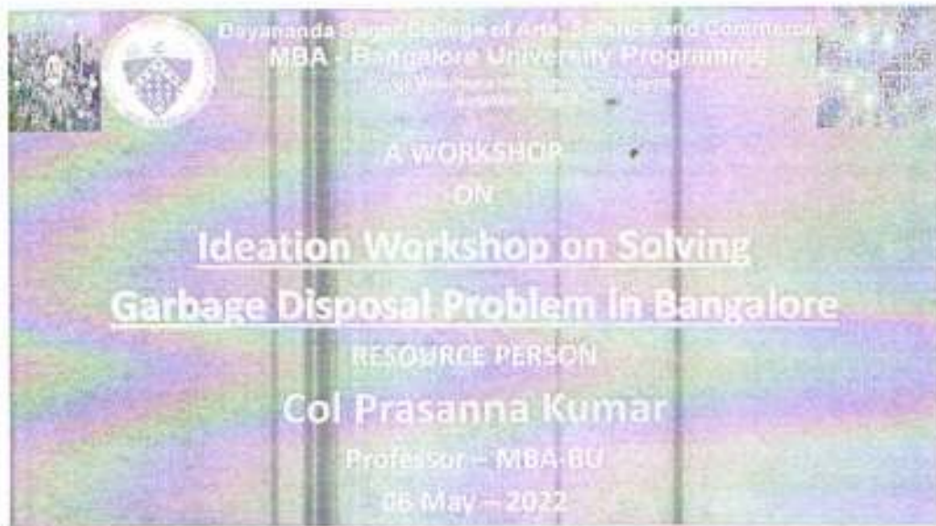
The main Banner of Ideation Workshop