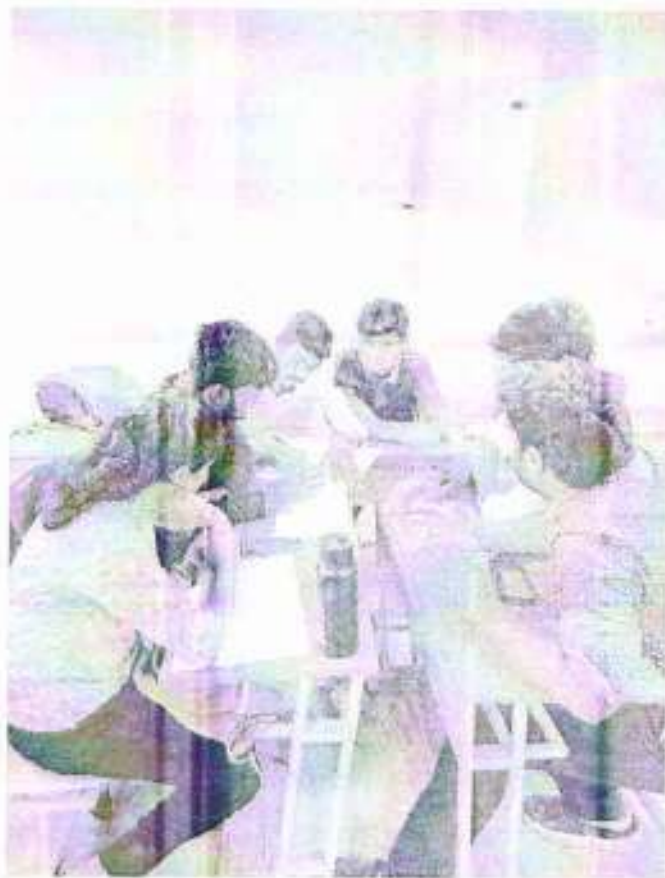
Intense discussions underway within a team on the flow of their App's functions