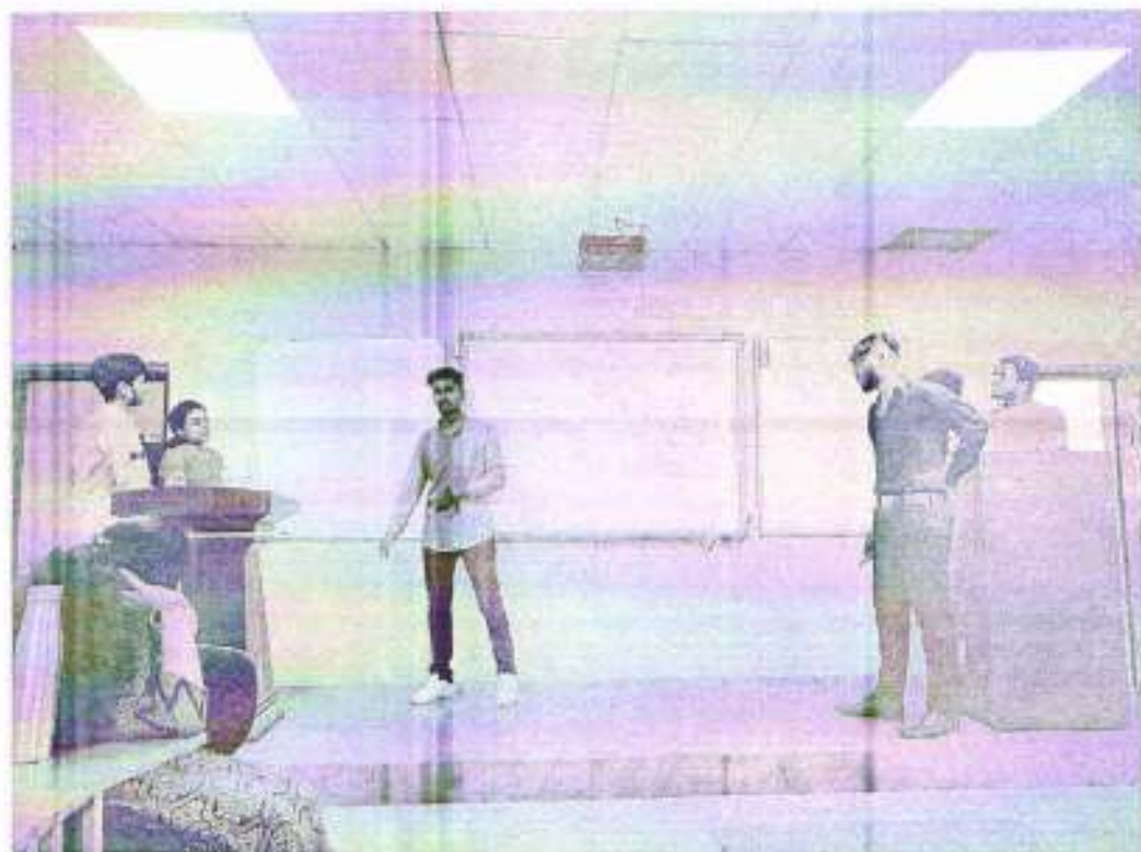
Another syndicate explaining the functioning of their App to the Audience