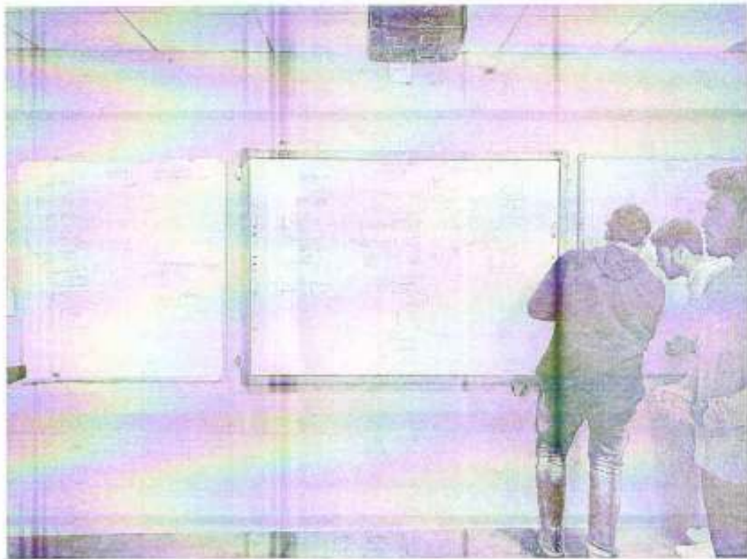
Second Syndicate drawing their proposed workflow for the App