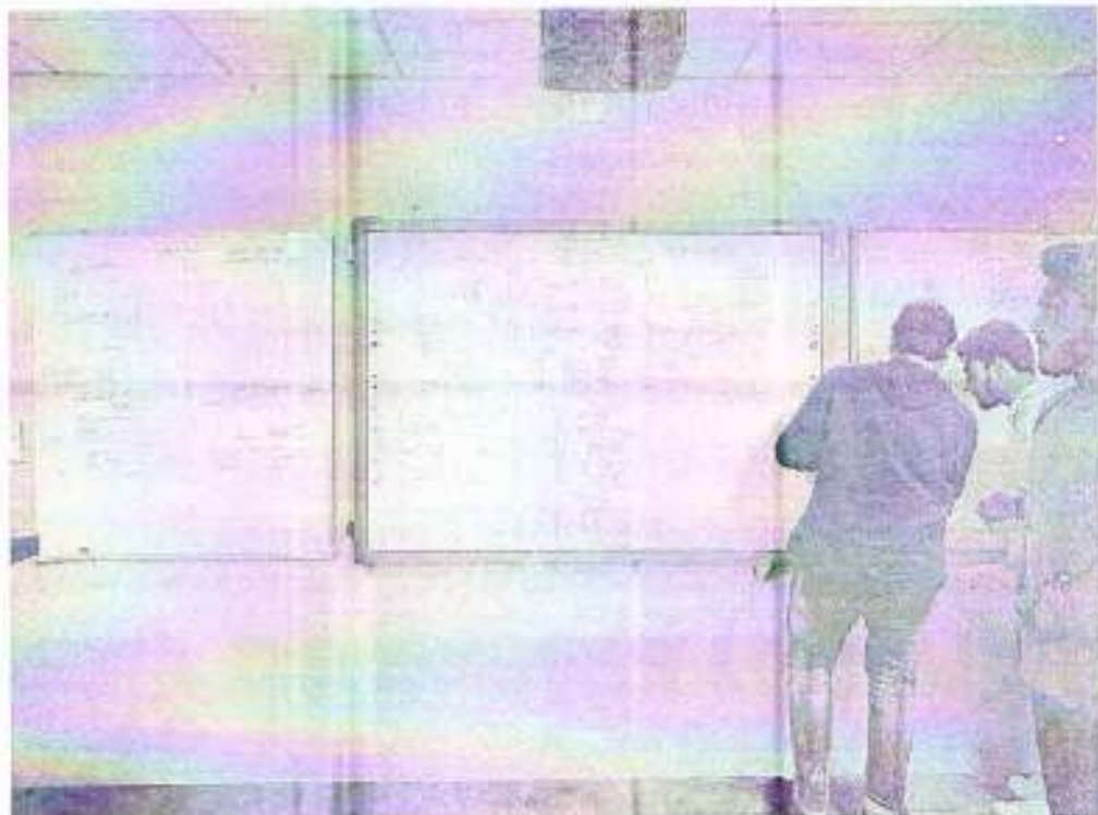
Second Syndicate drawing their proposed workflow for the App