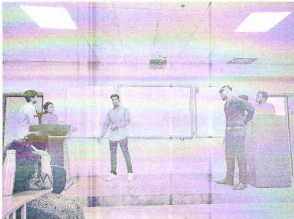
Another syndicate explaining the functioning of their App to the Audience