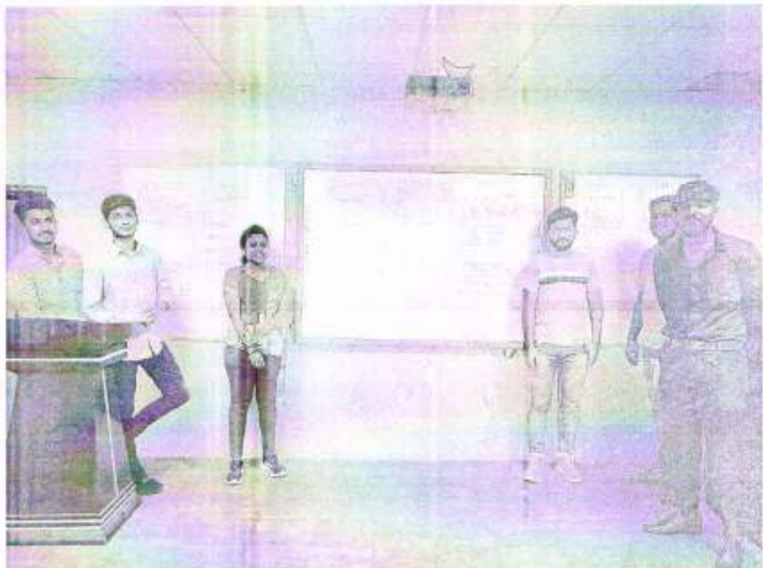
One Syndicate showing their proposed Plan for an App for Garbage Disposal