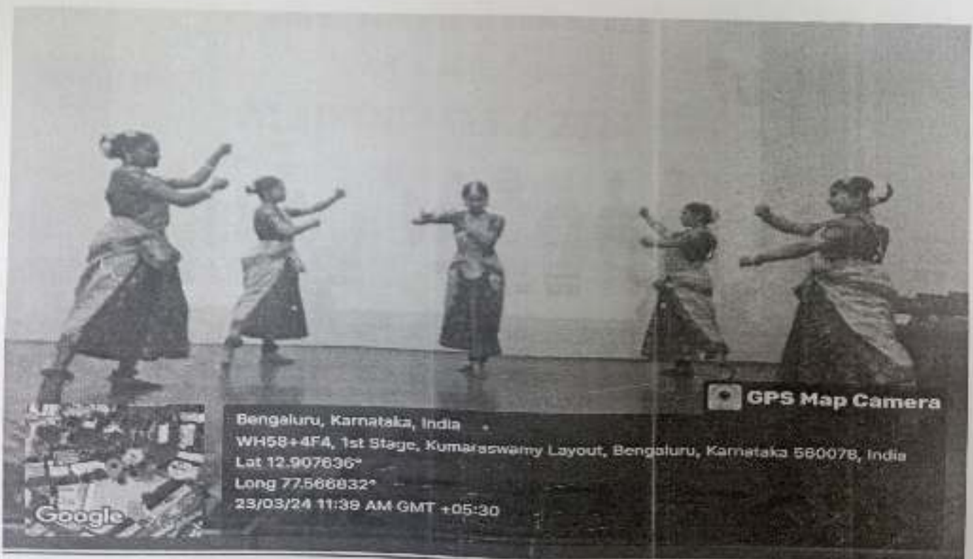
Image 04: MBA Students Bharatanatyam Performance at Alumni meet 2024