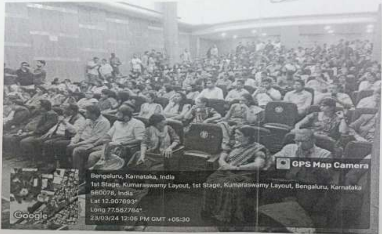
Image 01: Alumni Students and faculty members gathered at C D Sagar Auditorium