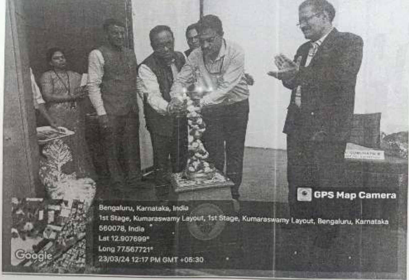
Image 03: Inauguration of Alumni meet 2024 by lighting up the lamp