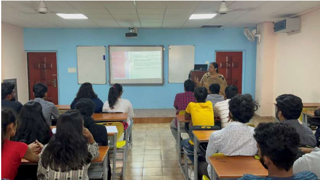
Photo 3: Students being attentive towards the session on Student Grievance Cell