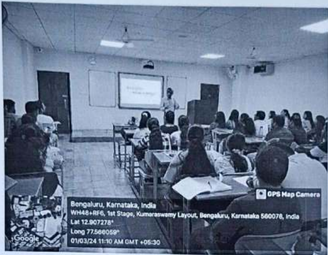
Figure 2: Students' interaction with the speaker.