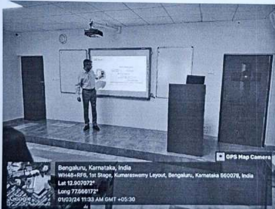
Figure 3: Presentation by the Guest speaker.