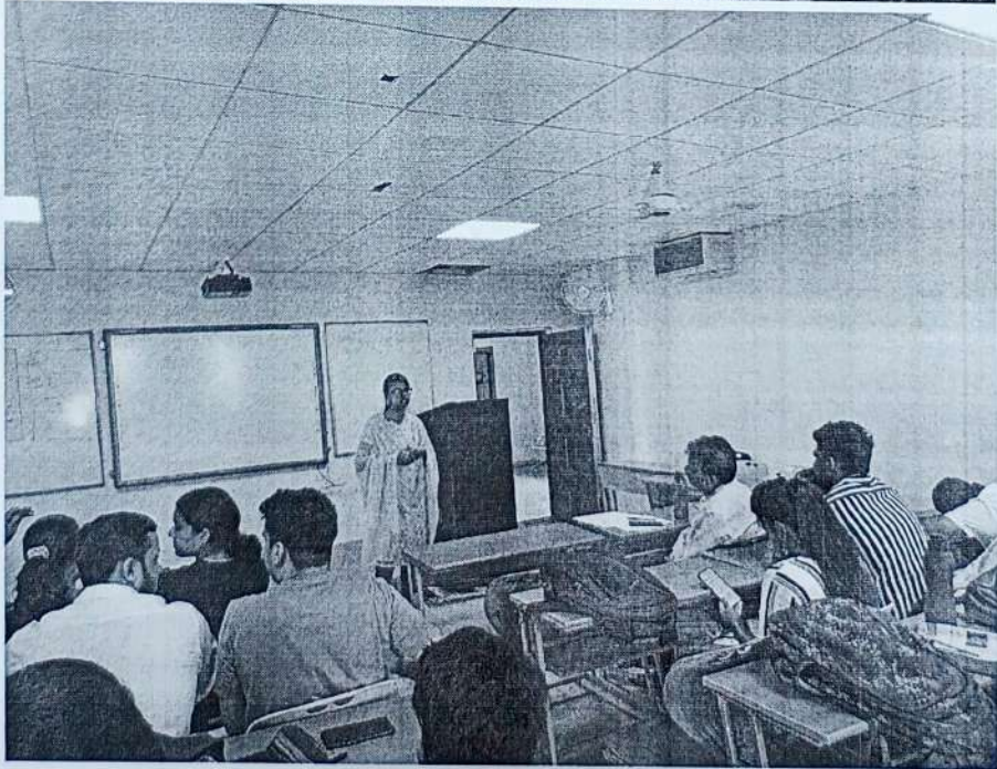
Figure 2: Students speak on Swami Vivekananda