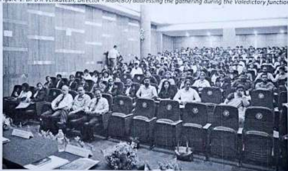
Figure 2: Audience attending the valedictory function