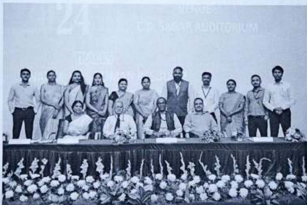
Figure 6: Department Faculty