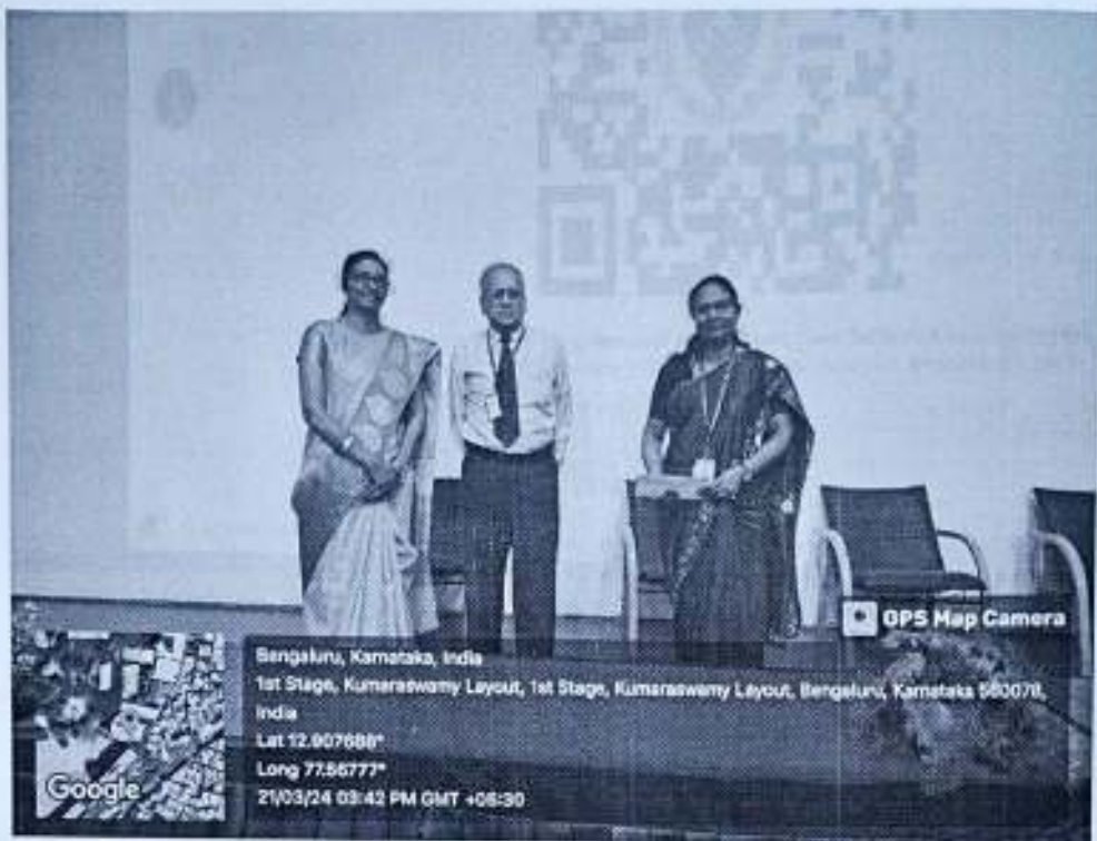
Figure 5: Faculty Coordinators with Track Head, Finance