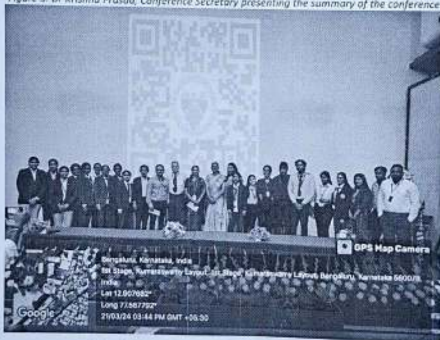
Figure 4: Faculty Coordinators with student Coordinators