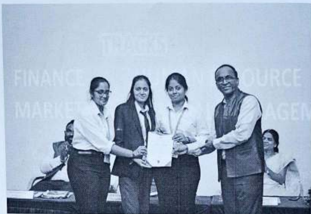
Figure 9: Winners of Finance Track