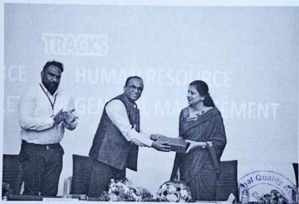
Figure 8: Director -MBA(BU) handing over memento to the Chief Guest