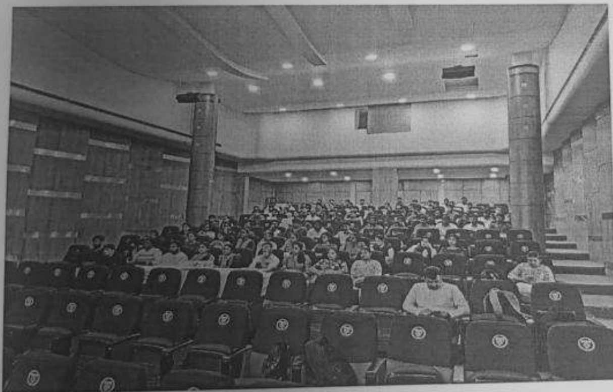
Figure 2 Student Participants attending the workshop