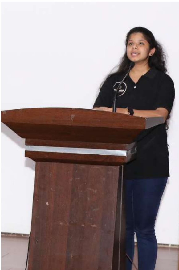
Figure 3 Prayer by MBA Student