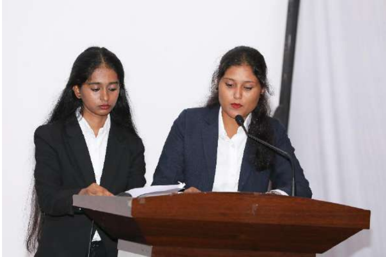
Figure 4 Master of Ceremony