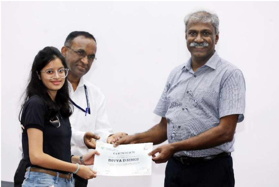
Figure 10 Certificate of Appreciation presented to the student for designing the club logo