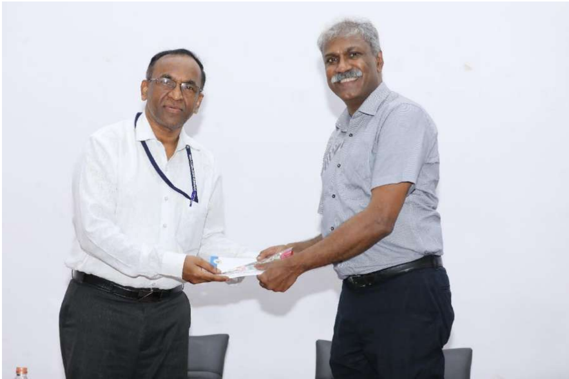
Figure 12 Handing over the Honorarium to the Chief Guest by the Director-MBA, BU