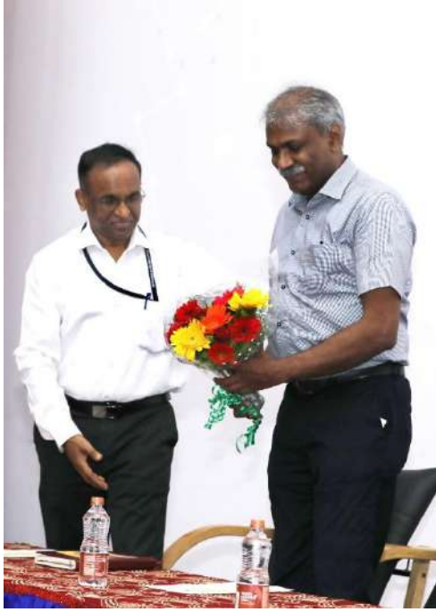
Figure 2 Welcoming the Chief Guest by the Director, BU