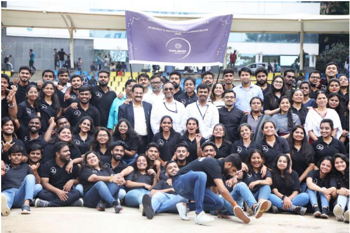
Figure 16 Group Photo MBA BU