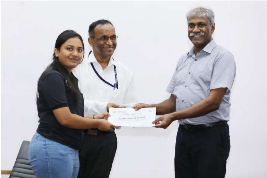
Figure 13 Certificate of Appreciation presented to a student for suggesting the tagline for the club