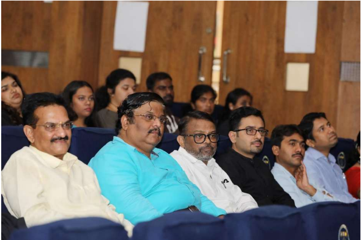
Figure 6 Faculty Members of MBA -BU