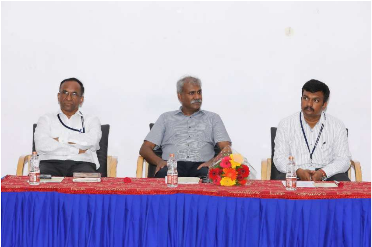
Figure 5 Director, Chief Guest and Faculty Coordinator