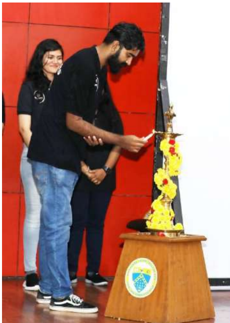
Figure 1 Lighting the lamp by the student coordinator

The inaugural was followed by a Flash mob by MBA students from the second semester.