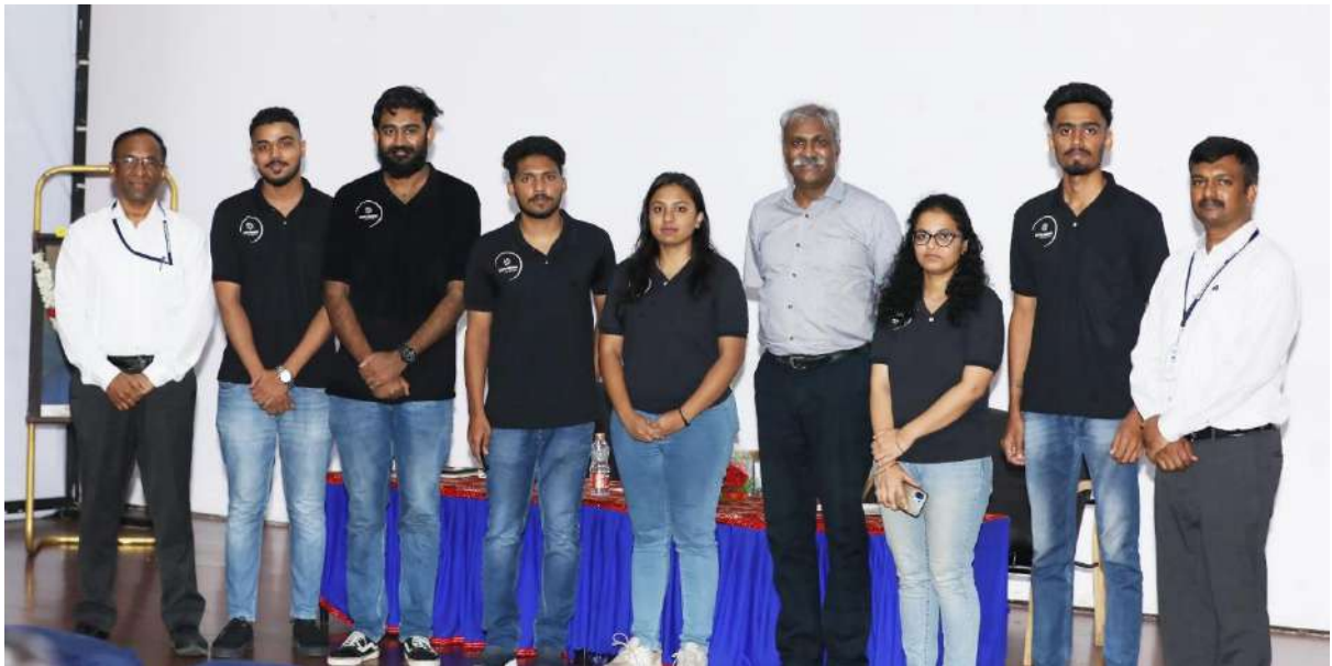
Figure 7 Faculty with the Elected Office Bearers of the Club