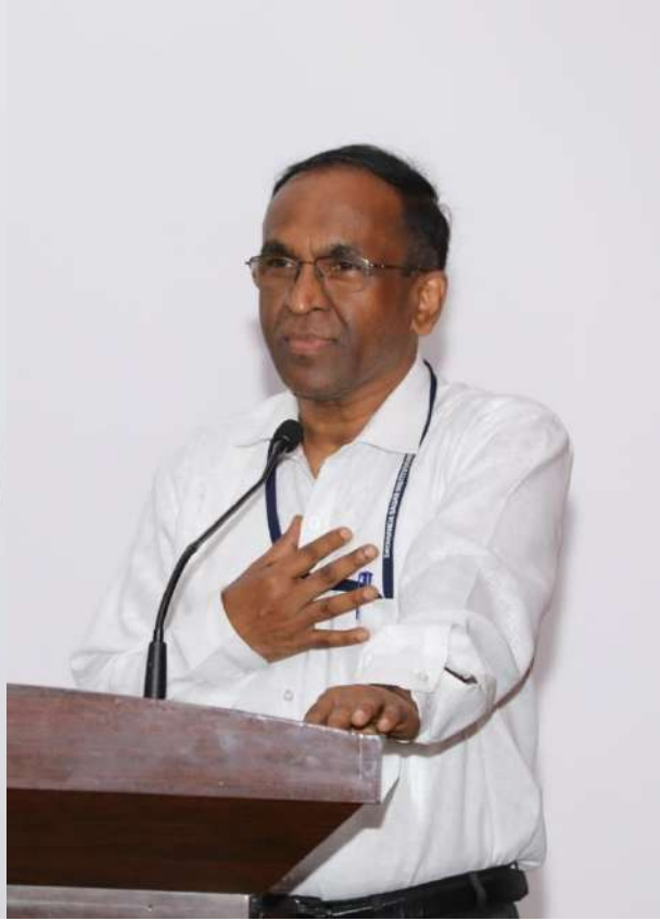
Figure 9 Address by the Director