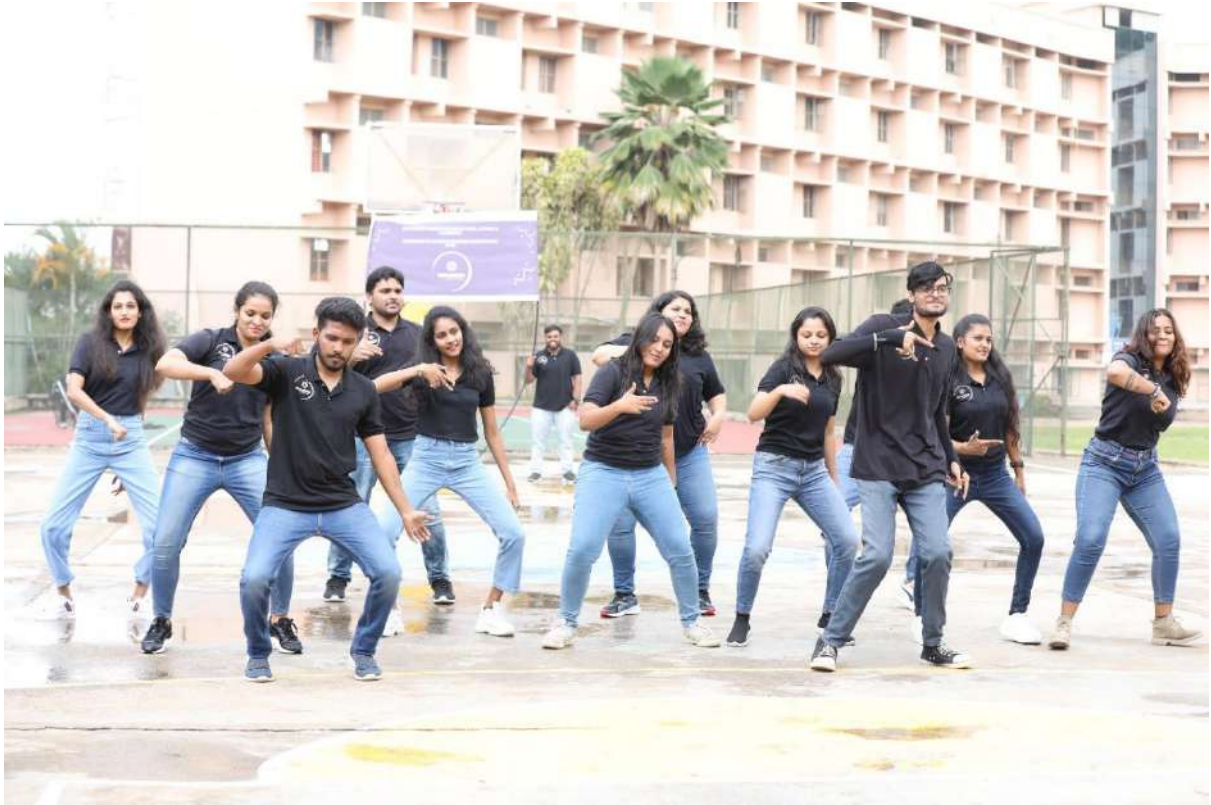
Figure 15 Flash mob by MBA BU Students