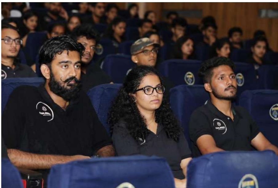
Figure 14 Student Participants