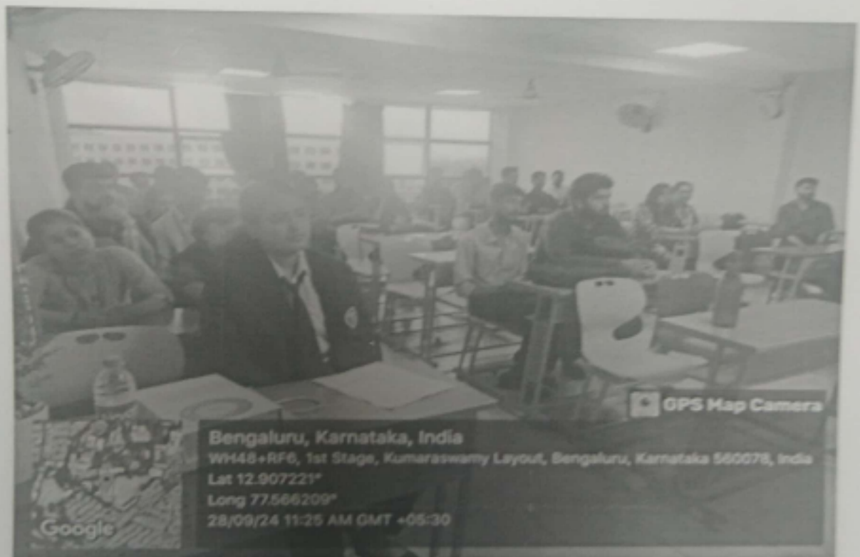
Students of 2 nd sem MBA attending the Alumni Guest talk