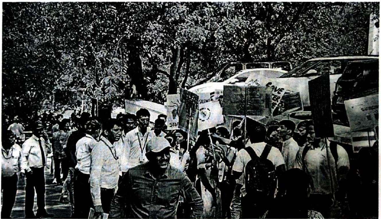
Figure 2: Students holding Placards