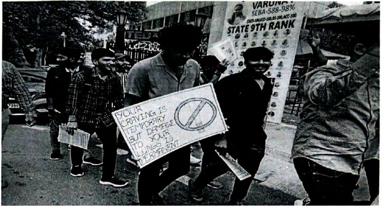
Figure 1: Student participants in the rally