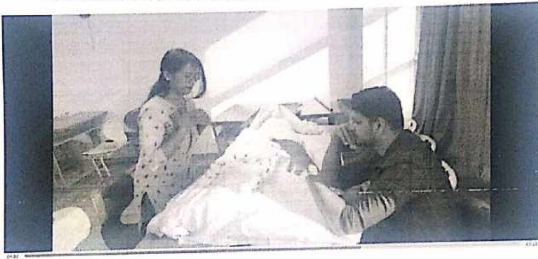
Photo 4: Roleplay on Appropriate and Inappropriate behaviours in a funeral