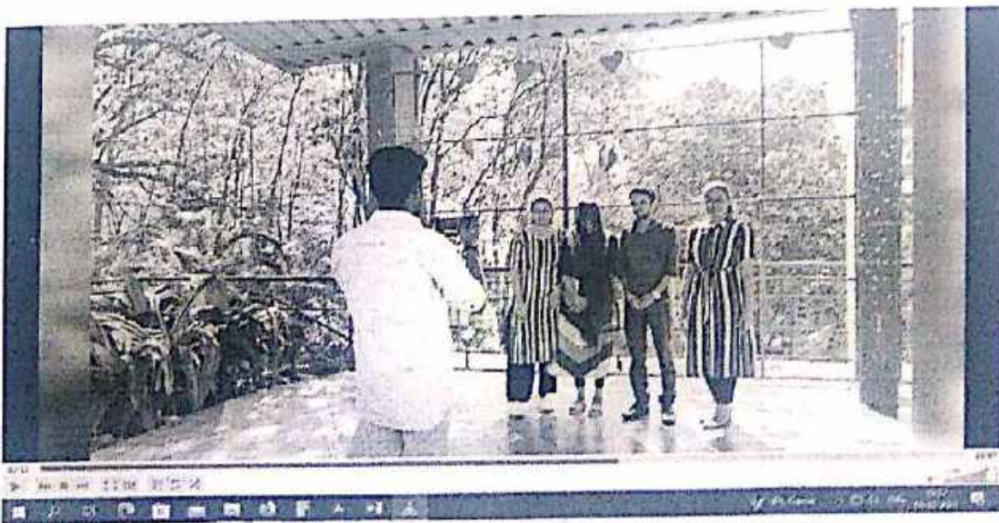
Photo 5: Video snapshot of role-play on Appropriate and Inappropriate behaviours in wedding