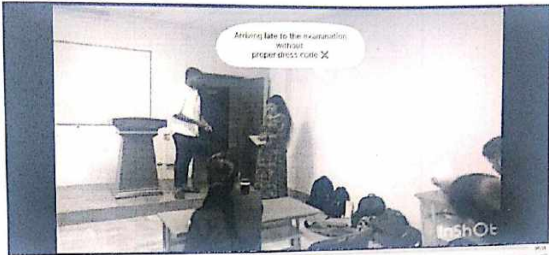
Photo 3: Video snapshot of inappropriate behaviours shown in the role-play