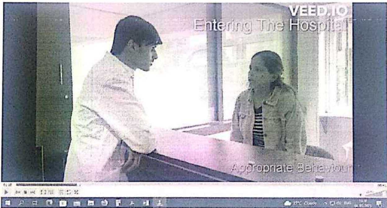
Photo 2: Roleplay on Appropriate and Inappropriate behaviours when one visits the hospital