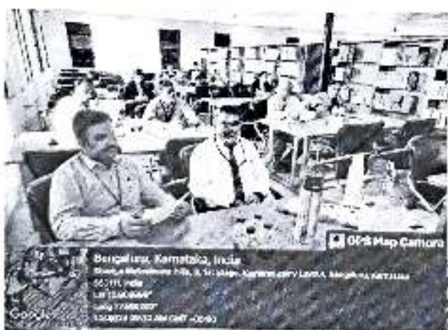
Bengaluru, Karnataka, India W840-890, 1st Stage, KulkarniNagar Layout, Bengaluru, Karnataka 560070, India Lat: 12.900000° Long: 77.592279° 14/08/2018 08:27 AM GMT +05:30