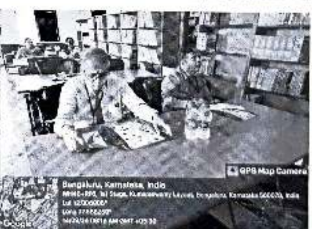
Bengaluru, Karnataka, India W840-890, 1st Stage, KulkarniNagar Layout, Bengaluru, Karnataka 560070, India Lat: 12.900000° Long: 77.592279° 14/08/2018 08:27 AM GMT +05:30