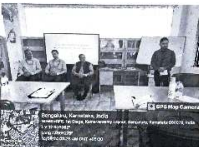
Bengaluru, Karnataka, India W840-890, 1st Stage, KulkarniNagar Layout, Bengaluru, Karnataka 560070, India Lat: 12.900000° Long: 77.592279° 14/08/2018 08:27 AM GMT +05:30