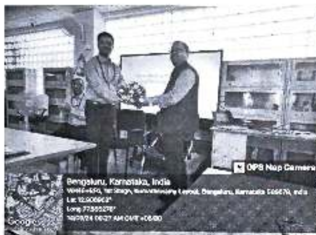
Bengaluru, Karnataka, India W840-890, 1st Stage, KulkarniNagar Layout, Bengaluru, Karnataka 560070, India Lat: 12.900000° Long: 77.592279° 14/08/2018 08:27 AM GMT +05:30