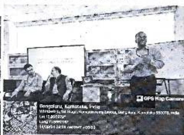
Bengaluru, Karnataka, India W840-890, 1st Stage, KulkarniNagar Layout, Bengaluru, Karnataka 560070, India Lat: 12.900000° Long: 77.592279° 14/08/2018 08:27 AM GMT +05:30