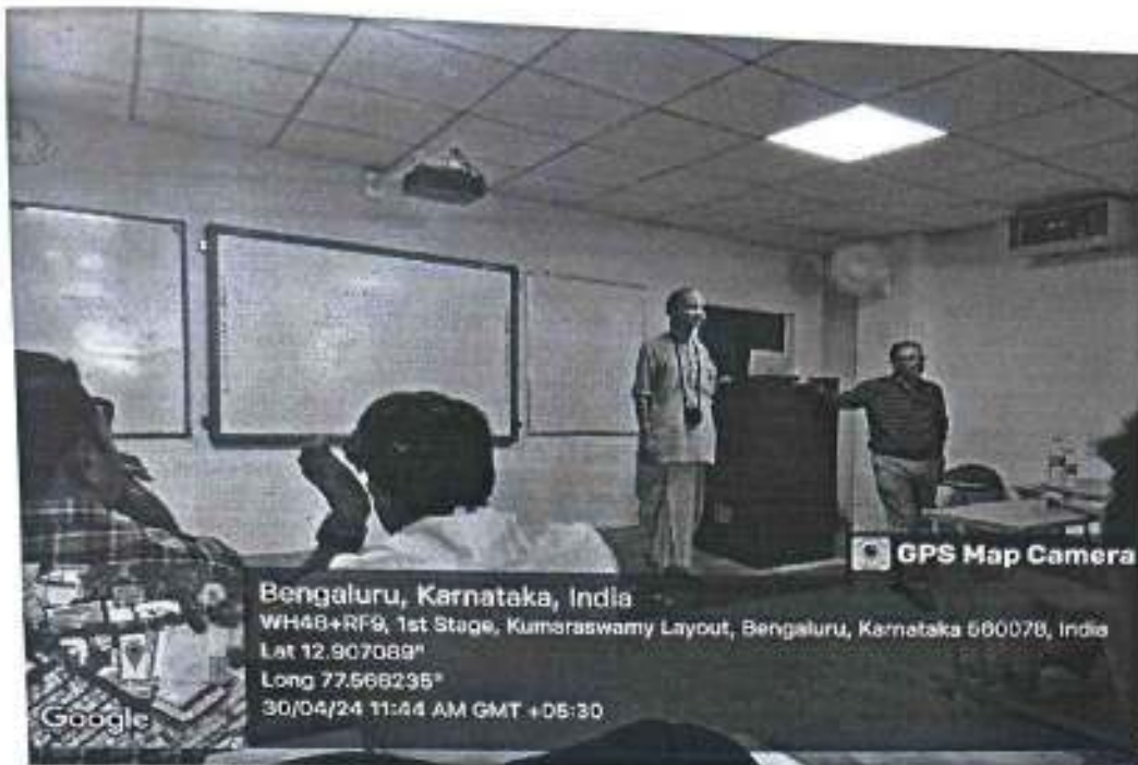
Figure 5 : Q & A session during guest lecture