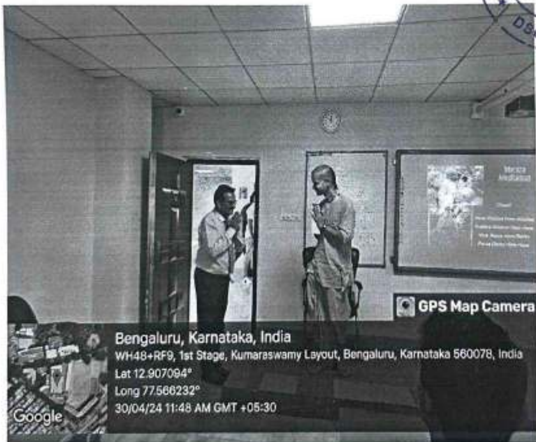
Figure 5 : Vote of thanks and closure of the session