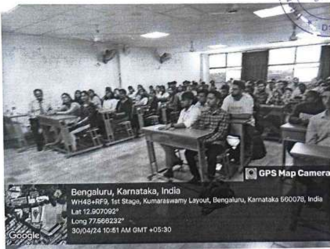
Figure 4 : Participants in guest lecture