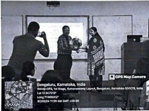
Bengaluru, Karnataka, India WH48+RFB, 1st Stage, Kumaraswamy Layout, Bengaluru, Karnataka 560078, India Lat 12.907213° Long 77.566312° 30/08/24 11:28 AM GMT +05:30