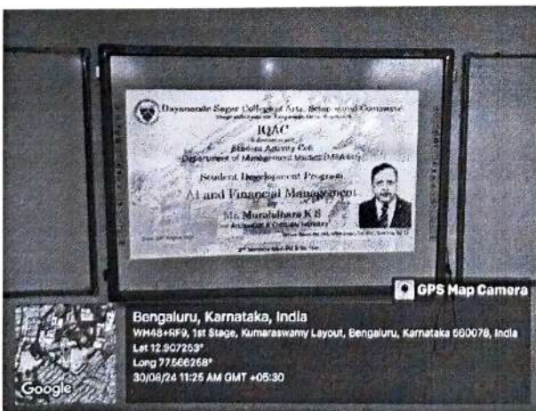
Bengaluru, Karnataka, India WH48+RFB, 1st Stage, Kumaraswamy Layout, Bengaluru, Karnataka 560078, India Lat 12.907259° Long 77.566368° 30/08/24 11:25 AM GMT +05:30