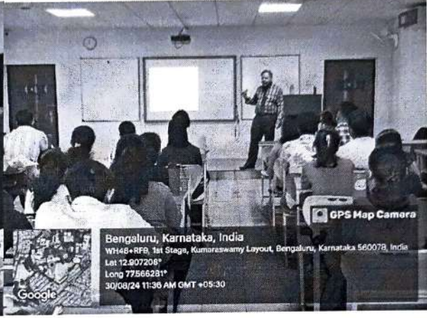
Bengaluru, Karnataka, India WH48+RFB, 1st Stage, Kumaraswamy Layout, Bengaluru, Karnataka 560078, India Lat 12.907208° Long 77.566281° 30/08/24 11:36 AM GMT +05:30