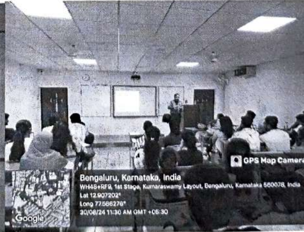
Bengaluru, Karnataka, India WH48+RFB, 1st Stage, Kumaraswamy Layout, Bengaluru, Karnataka 560078, India Lat 12.907204° Long 77.566376° 30/08/24 11:30 AM GMT +05:30