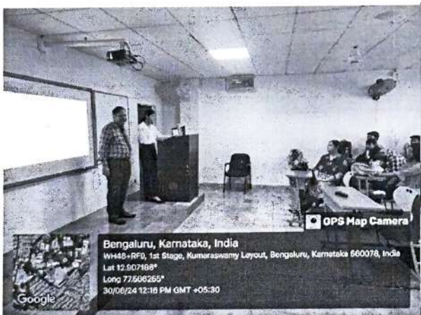
Bengaluru, Karnataka, India WH48+RFB, 1st Stage, Kumaraswamy Layout, Bengaluru, Karnataka 560078, India Lat 12.907188° Long 77.566285° 30/08/24 12:18 PM GMT +05:30